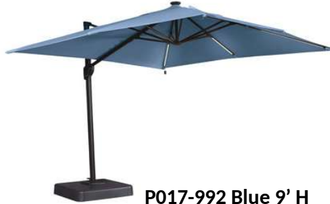
P017-992 Blue 9' H