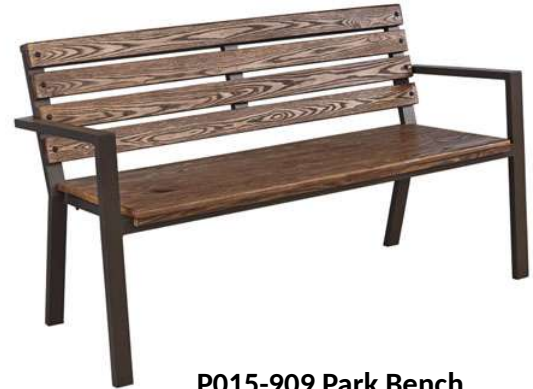
P015-909 Park Bench