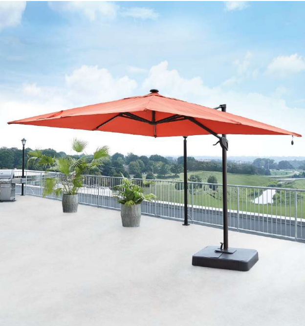
P017-990 Coral 9'H