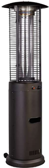
P015-905 Promo Patio Heater