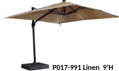
P017-991 Linen 9'H