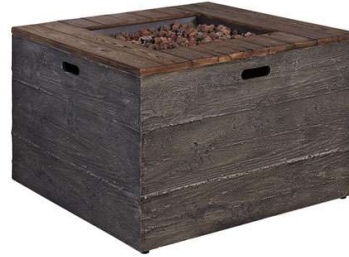
P015-772 Square Fire Pit