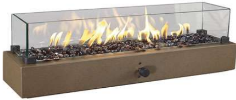
P015-913 Table Top Fire Bowl