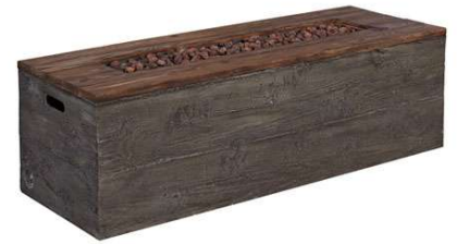
P015-773 Low Rectangular Fire Pit