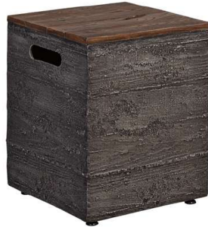
P015-907 Tank Storage Box