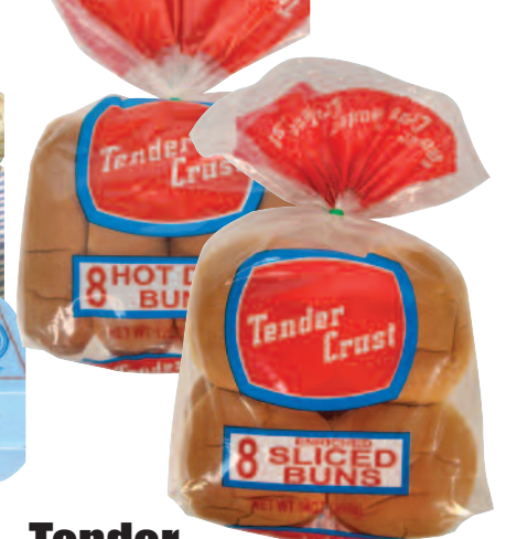
Tender Crust Buns HAMURGER OR HOT DOG 11-14 OZ. PKG. 8 CT.