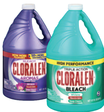
Cloralen Bleach 121 OZ. BTLs.