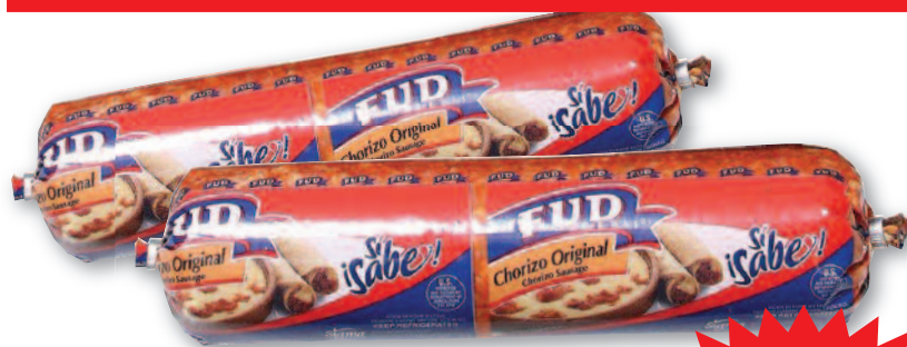
FUD Chorizo Original 8 OZ. PKG.