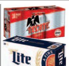
Coors, Coors Light, Miller Lite, Tecate, or Tecate Light 18 PACK 12 OZ. CANS OR BTLs.