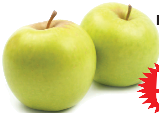
Golden Delicious Apples