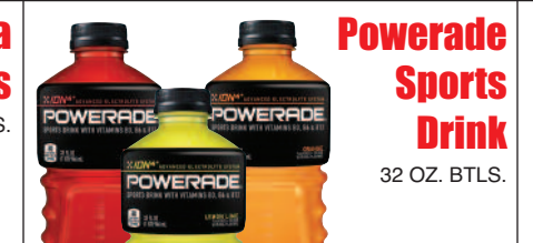
Powerade Sports Drink 32 OZ. BTLs.