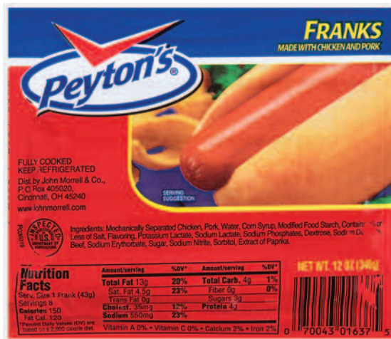
Peyton's All Meat Franks 12 OZ. PKG.