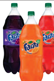
Fanta Flavors 2 LITER BTLs.