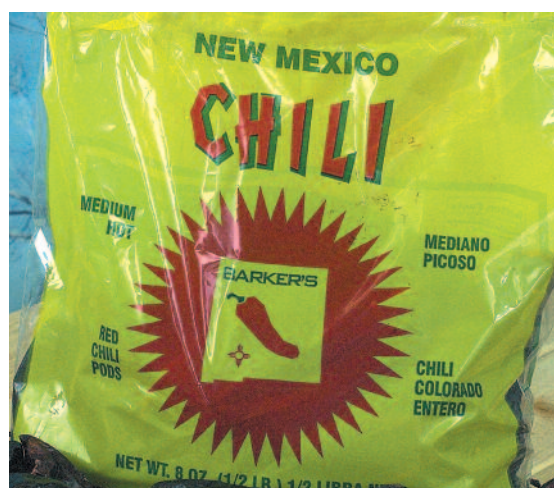
Barker's Chili Pods ALL VARIETIES 8 OZ. PKG.