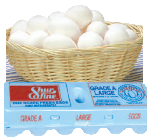
Shurfine Large Eggs DOZEN