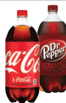
Coca-Cola Products ALL VARIETIES 3 LITER BTLs.