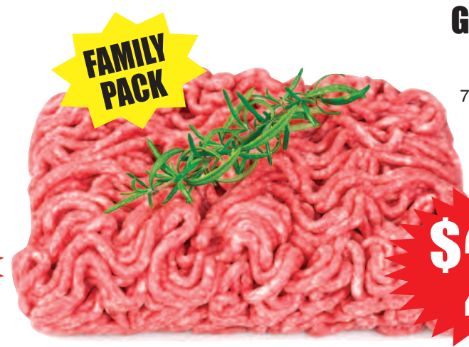
Ground Beef 73% LEAN