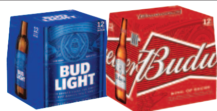
Budweiser Family 12 PACK 12 OZ. CANS OR BTLs.