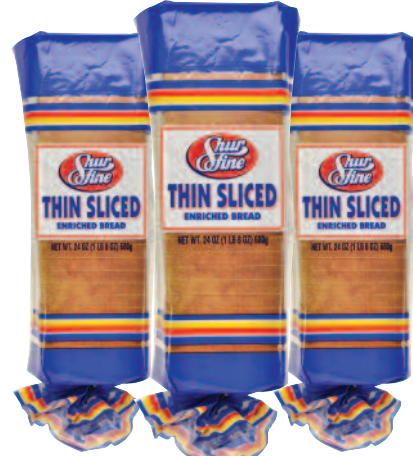
Shurfine Thin Sliced White Bread 24 OZ.