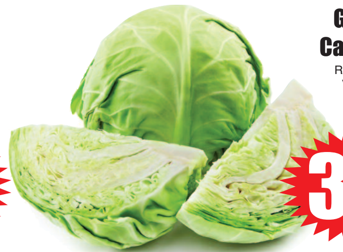
Green Cabbage REPOLLO VERDE