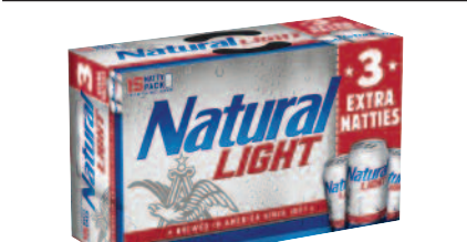
Natural Light 15 PACK 12 OZ. CANS