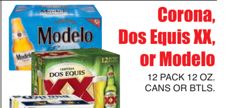
Corona, Dos Equis XX, or Modelo 12 PACK 12 OZ. CANS OR BTLs.