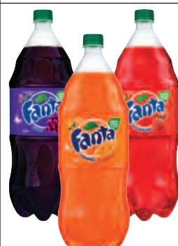
Fanta Flavors 2 LITER BTLs.