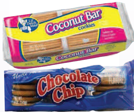
Lil' Dutch Maid Cookies ALL VARIETIES 5 OZ.