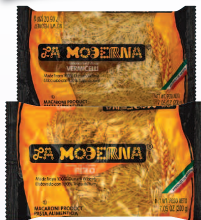
La Moderna Pasta ALL VARIETIES 7 OZ.

Solo En San Eli Supermarkets ALL THREE LOCATIONS