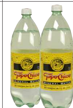
Topo Chico Mineral Water 1.5 LITER BTLs.