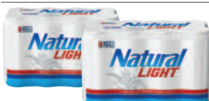
Natural Light 8 PACK 16 OZ. CANS