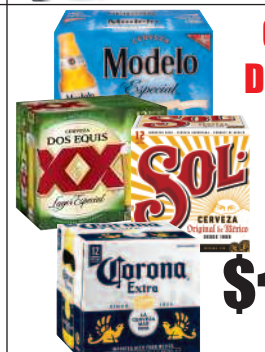
Corona, Sol, Dos Equis XX, or Modelo 12 PACK 12 OZ. BTLs.