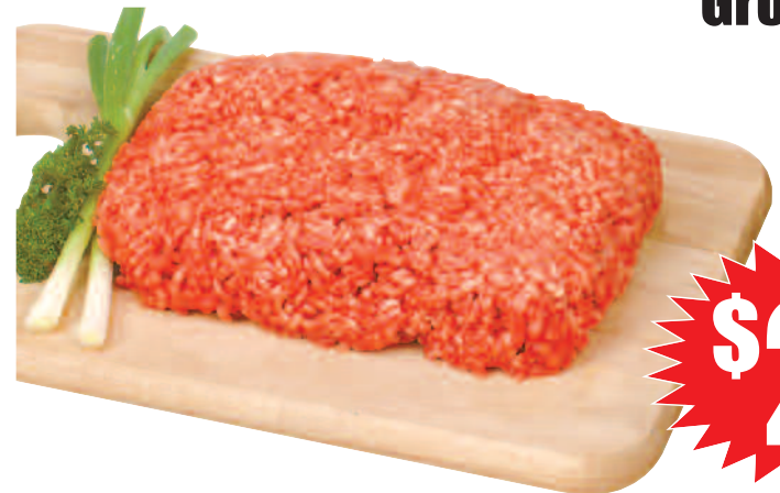
Ground Beef 75% LEAN