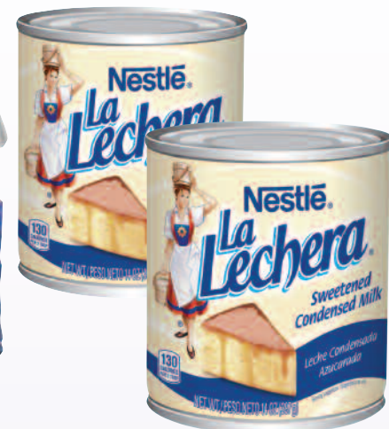
Nestle La Lechera SWEETENED CONDENSED MILK 14 OZ.