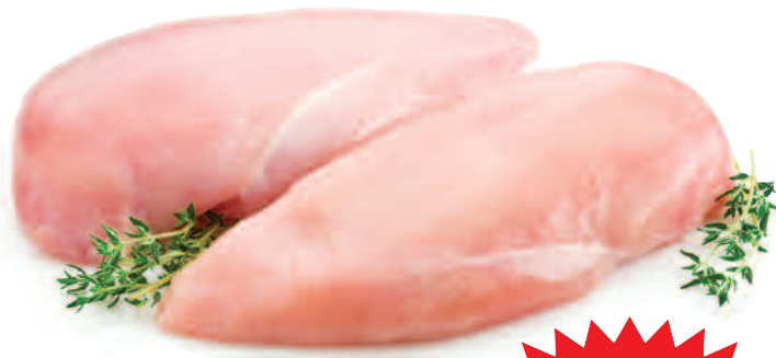
Fresh Chicken Breasts BONELESS SKINLESS