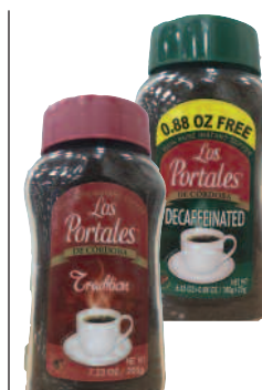
Los Portales Instant Coffee TRADITIONAL OR DECAFFEINATED 7.23 OZ.