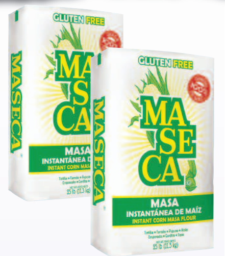
Maseca Masa INSTANT CORN MASA FLOUR 4.4 LBS.