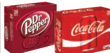
Coca-Cola Products ALL VARIETIES 20 PACK 12 OZ. CANS