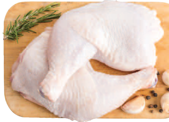
Chicken Leg Quarters PIERNA DE POLLO