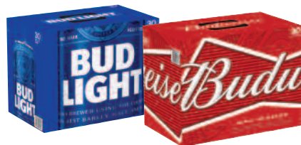
Budweiser or Bud Light 30 PACK 12 OZ. CANS