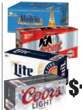
Coors Light, Coors Light, Miller Lite, Tecate, Tecate Light, or Modelo 18 PACK 12 OZ. CANS OR BTLs.