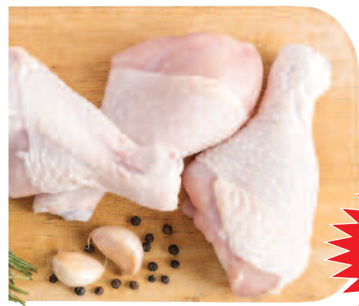
Fresh Jumbo Chicken Drumsticks