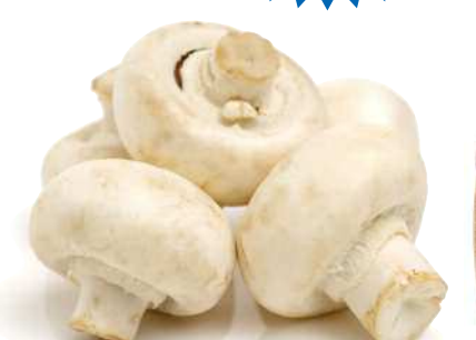
Whole Mushrooms 8 OZ. CELLO PKG.