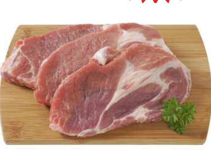
Pork Steak BONE-IN