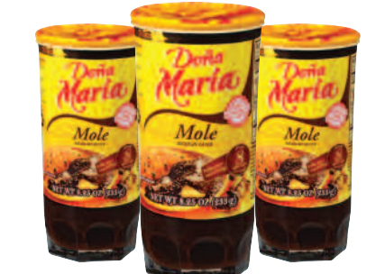
Doña María Mole 8.25 OZ.