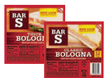
Bar S All Meat Bologna 12 OZ.