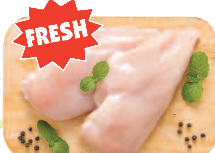
Fresh Chicken Breast BONELESS SKIBLESS