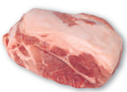
Boston Butt Pork Roast 2 PIECE CRYO-VAC