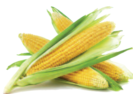
Fancy Yellow Corn