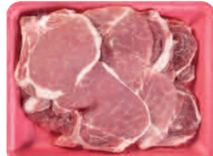
Quarter Loin Pork Chops ASSORTED CUTS