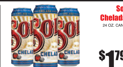
Sol Chelada 24 OZ. CANS