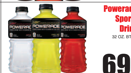
Powerade Sports Drink 32 OZ. BTLS.