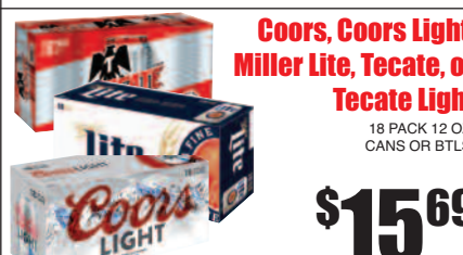
Coors, Coors Light, Miller Lite, Tecate, or Tecate Light 18 PACK 12 OZ. CANS OR BTLS.