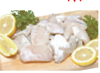
Catfish Nuggets FARM RAISED