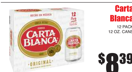
Carta Blanca 12 PACK 12 OZ. CANS