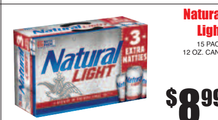
Natural Light 15 PACK 12 OZ. CANS