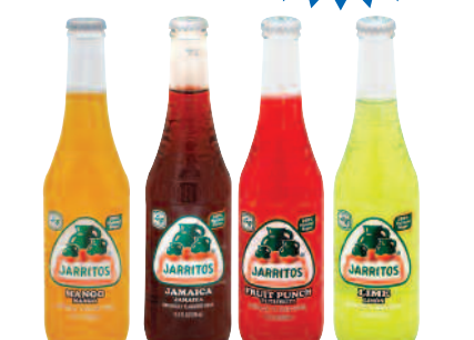
Jarritos Family 12.5 OZ. BTLS.