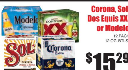
Corona, Sol, Dos Equis XX, or Modelo 12 PACK 12 OZ. BTLS.