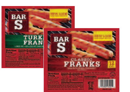
Bar S All Meat Franks 12 OZ.