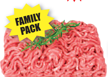
Ground Beef 75% LEAN