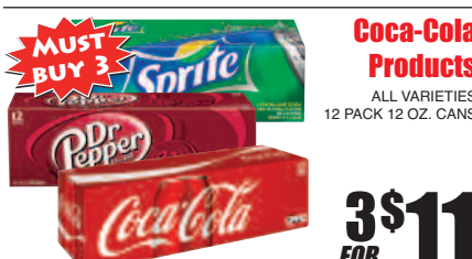
Coca-Cola Products ALL VARIETIES 12 PACK 12 OZ. CANS