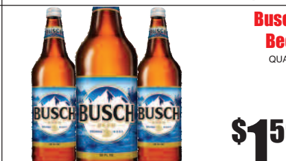
Busch Beer QUART