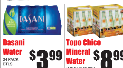
Dasani Water 24 PACK BTLS.