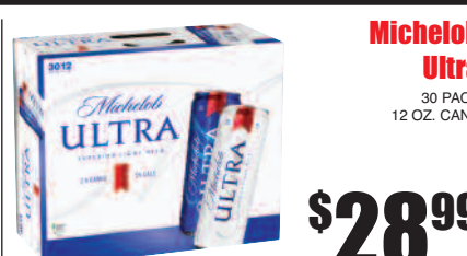
Michelob Ultra 30 PACK 12 OZ. CANS