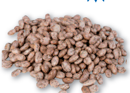
Pinto Beans FRIJOL PINTO