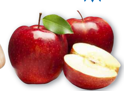
Red Delicious Apples MANZANA ROJA