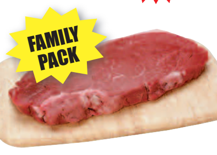
Top Round Steak BONELESS BEEF