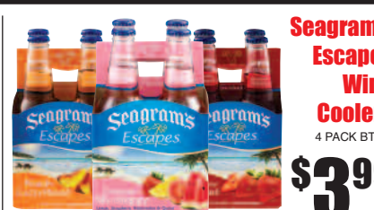
Seagram's Escapes Wine Coolers 4 PACK BTLS.