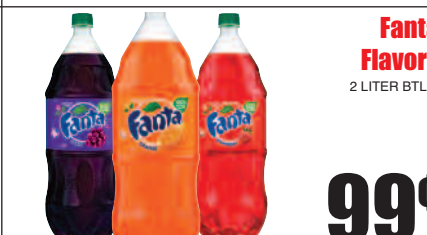
Fanta Flavors 2 LITER BTLS.