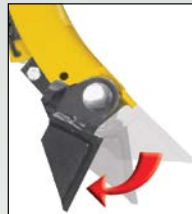
Bottom-trip available on RPDE-10 only.