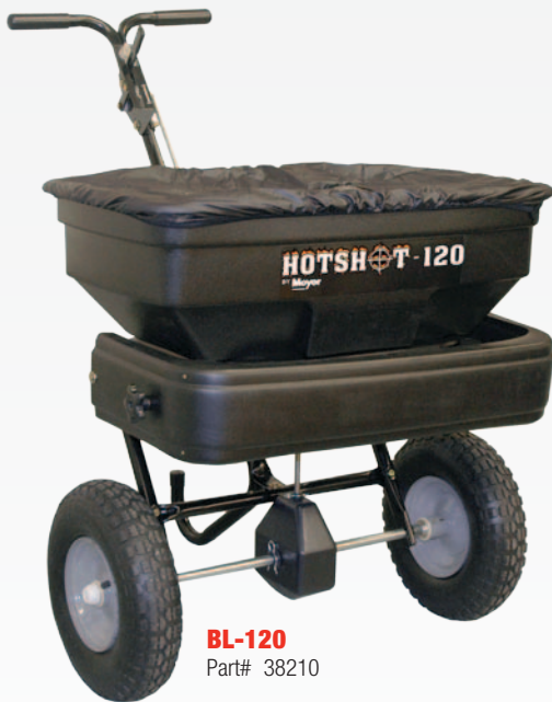
BL-120 Part# 38210