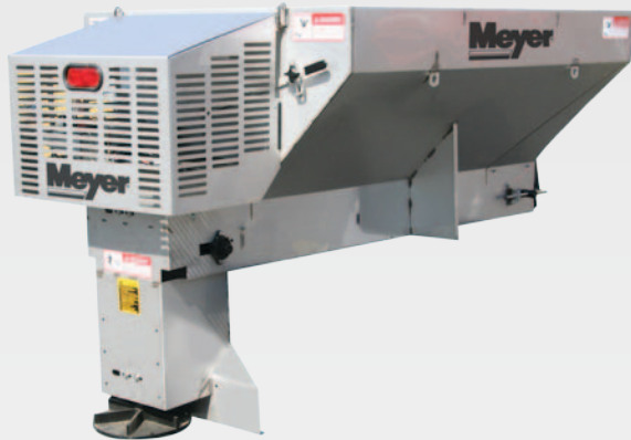
BL-600 Part# 64238