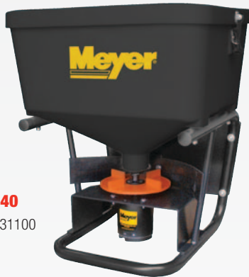
BL-240 Part# 31100