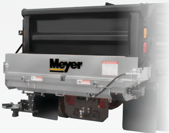
BL-960 Part# 64230