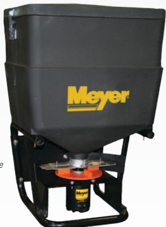
BL-400 Part# 36100 Shown with optional flowgate controller.