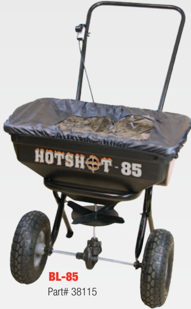
BL-85 Part# 38115