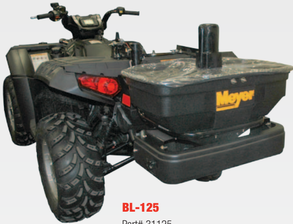
BL-125 Part# 31125