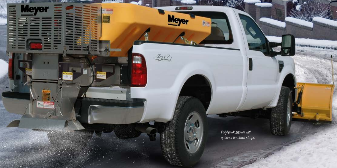
PolyHawk shown with optional tie down straps.