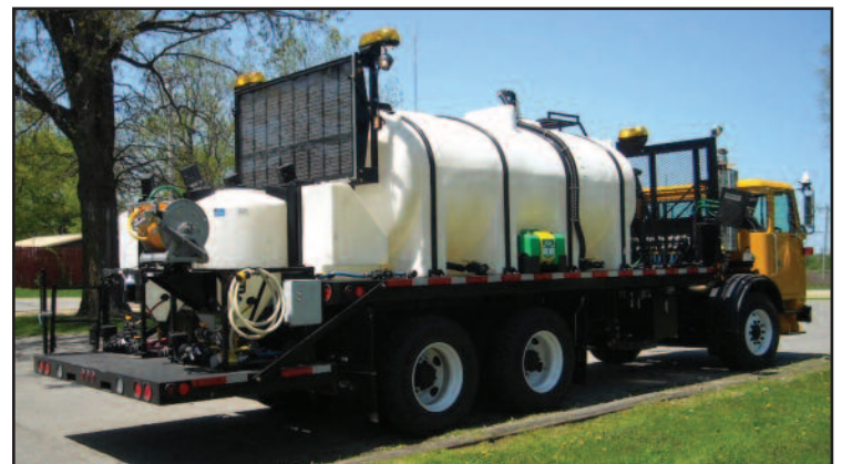
2700 Gallon Unit