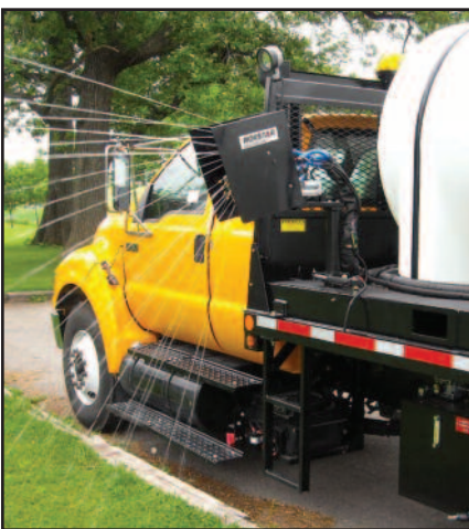
Spray Head: Front, Mid or Rear Mounted. Multi-Zone Spray Load with 30° Linear Actuation Tilt to Follow Ground Contour.