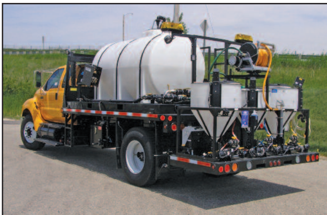
1000 Gallon System w/ Removable Skid