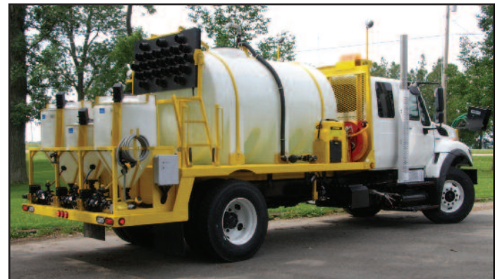
1300 Gallon, 4 Product Injection System with Sign Board Option

Equipped with 1 to 4 Chemical Injection System