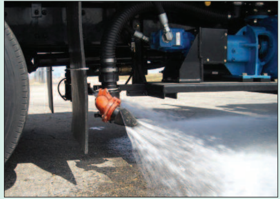
Street Flusher System