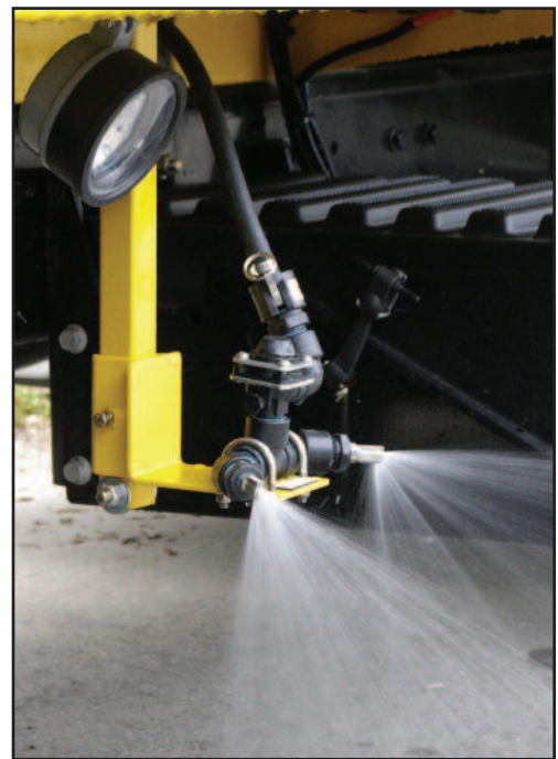
Guard Rail Underbody Spray Booms Manual or Power Height Adjustable. Optional Spot Light Shown