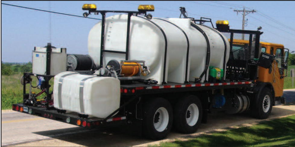
2700 Gallon Flusher System w/ Removable Rear Skid