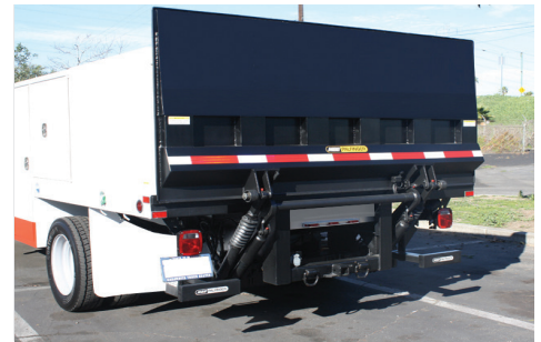
FLEET OPERATOR SIMPLICITY & DURABILITY PROVIDE MAXIMUM VALUE

The corrosion-protected hardened pins, together with perforated bushings, are able to load up with grease for minimized service intervals, all while going the distance. This is just a small sample of all of the details that go into the ILK to make it an extremely low maintenance liftgate.