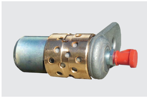
BUSHINGS AND GREASE ZERKS TO CUT DOWN ON COSTLY REPAIRS

The Control System, now with built-in visible diagnostics, provides you the status of your lift and can assist you with quickly diagnosing low voltage as well as other problems. Other features include built-in cycle counting, and a re-settable service counter. It's ready for today's telematics technology to provide feedback to fleet management through your truck's CAN bus system. The PC board is now mounted in a sealed heavy duty hinged enclosure.