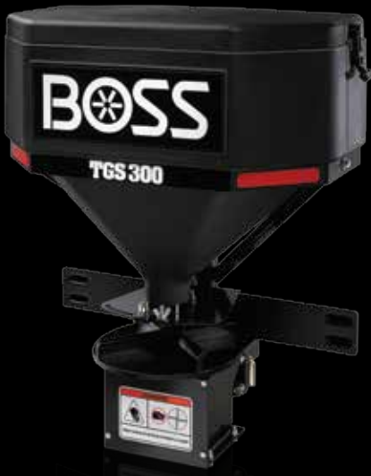
TGS 300 fits on vehicles with Class 2-4 hitches.

The selection of proper deicing materials can be complicated and varies by personal preference, experience and environmental concerns. All factors should be considered before making your selection.