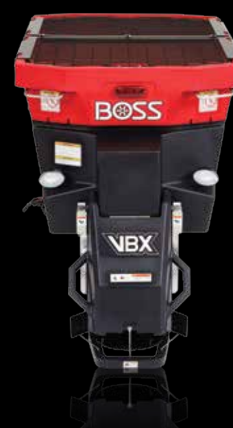
VBX 8000 2 cubic yards of capacity