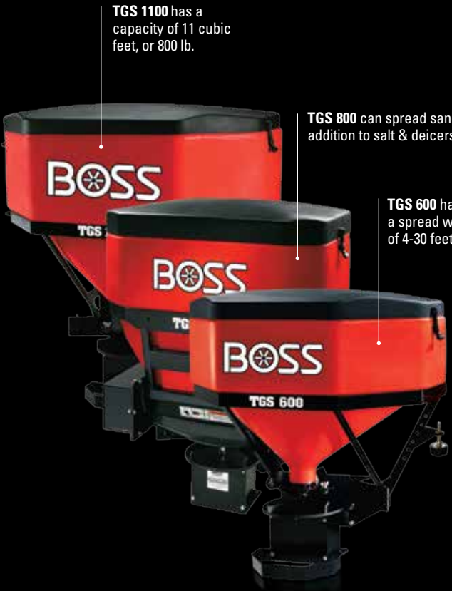
TGS 1100 has a capacity of 11 cubic feet, or 800 lb.