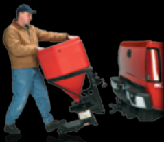
Optional RT3 Attachment System allows you to easily attach/detach your spreader (not available on TGS 300).