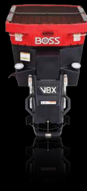
VBX 6500 1.5 cubic yards of capacity