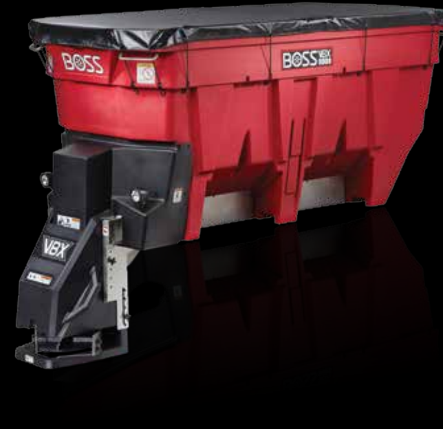
VBX 9000 3 cubic yards of capacity