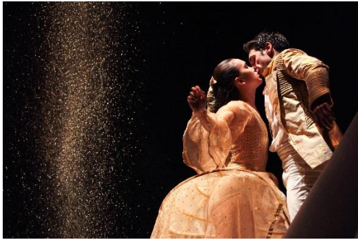
Jean-Christophe Maillot's Cinderella Les Ballets de Monte-Carlo