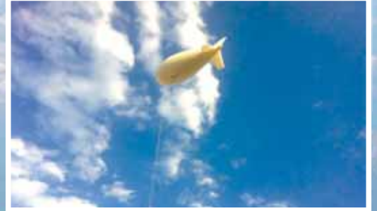
DORUK Tactical Aerostat System