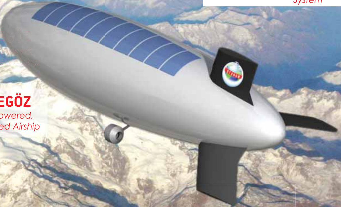
TEPEGÖZ Solar Powered, Unmanned Airship