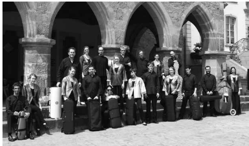
EUBO "orchestra-in-residence" in Echternach

notably in Echternach, Luxembourg, where, with the support of local partners, it recorded this CD in the impressive Trifolion concert hall.