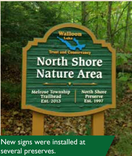
New signs were installed at several preserves.

Conservancy staff worked closely with officials in Resort Township this year to evaluate a Farmland and Open Space Preservation Ordinance proposal received in 2013. This unique ordinance provides support and funding for conservation easements to protect lands, allowing landowners to make significant investments in their land – usually working lands – and protect important landscapes at the same time. While an agreement was not reached with the landowner in 2014, the Conservancy will continue to work with Township officials in support of this program.