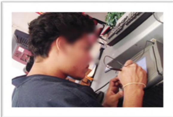
An inmate signs off on his correct information as part of the intake process.