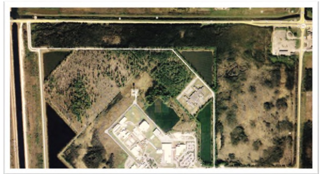
Krome Detention Center | 18201 South West 12 th Street Miami, Florida