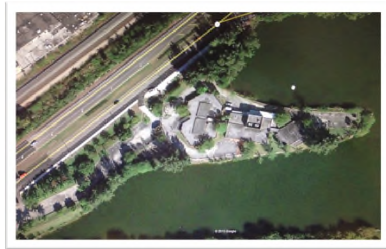
North Dade Detention Center | 15801 North State Road Miami, Florida