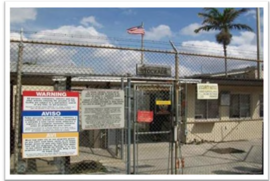
Training and Treatment Center | 6950 NW 41st Street, Miami, Florida