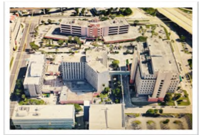
Pre-Trial Detention Center | 1321 NW 13th Street, Miami, Florida