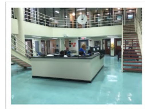
Typical Behavioral Health Unit