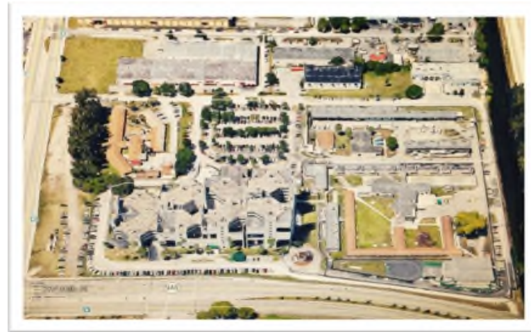
Turner Guilford Knight Correctional Center | 7000 NW 36 Street, Miami, Florida