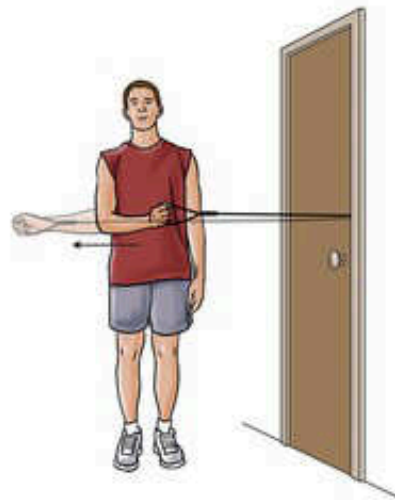
Resisted shoulder external rotation