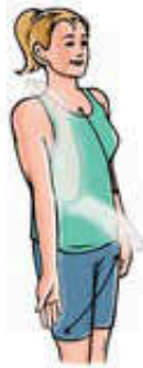
Active elbow flexion and extension