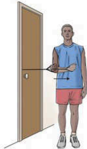
Resisted shoulder internal rotation