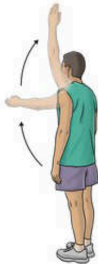
Single-arm shoulder flexion