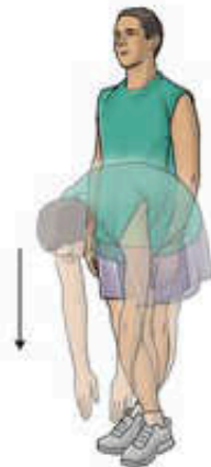
Iliotibial band stretch (standing)