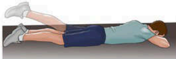
Prone hip extension