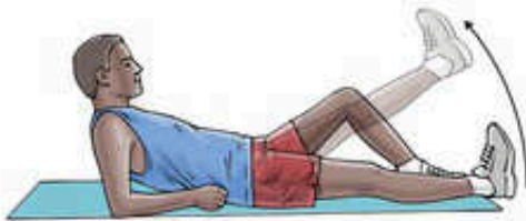
Straight leg raise