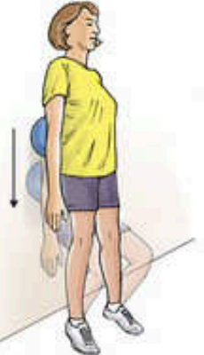
Wall squat with a ball