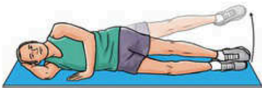
Side-lying leg lift