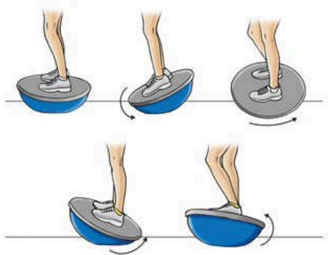
Wobble board exercise B