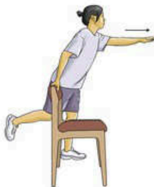
Balance and reach exercise A