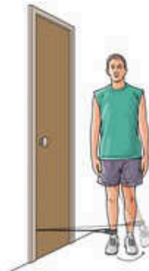
Knee stabilization: D