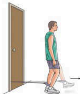
Knee stabilization: C