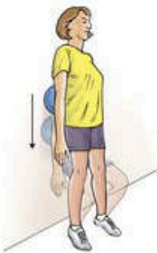
Wall squat with a ball