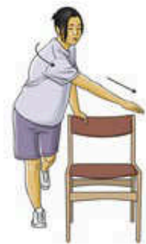
Balance and reach exercise B