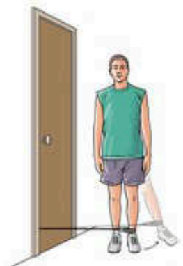
Knee stabilization: B