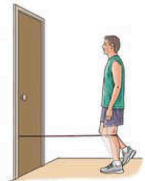
Resisted terminal knee extension