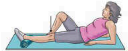
Passive knee extension