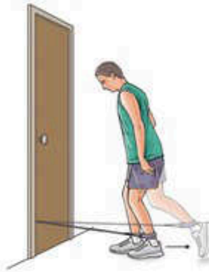
Knee stabilization: A