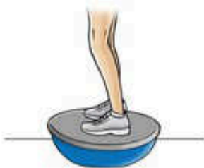
Wobble board exercise C