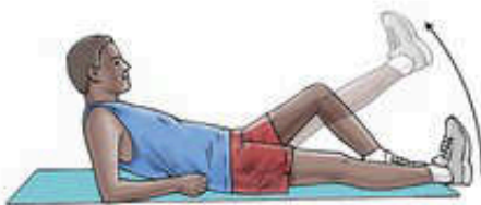
Straight leg raise