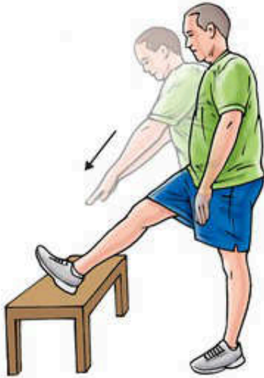
Standing hamstring stretch