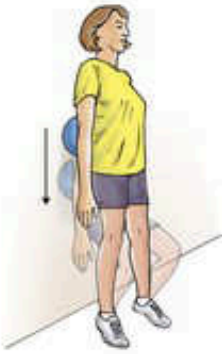
Wall squat with a ball