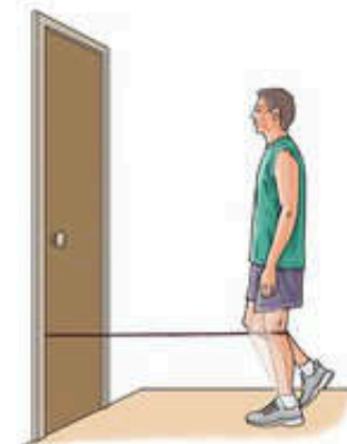
Resisted terminal knee extension