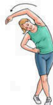
Iliotibial band stretch (side-bending)