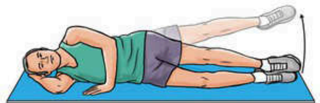
Side-lying leg lift