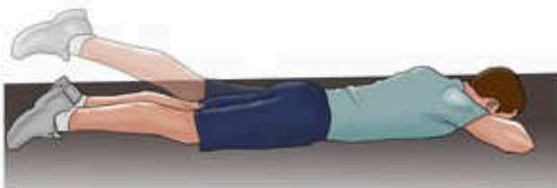
Prone hip extension