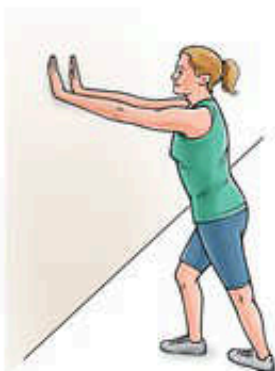
Standing calf stretch