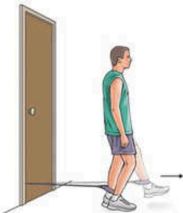
Knee stabilization: C