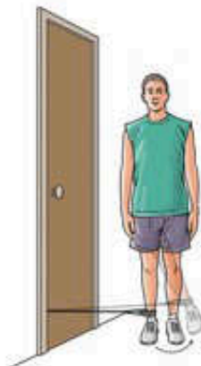
Knee stabilization: D