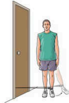
Knee stabilization: B