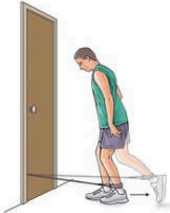
Knee stabilization: A