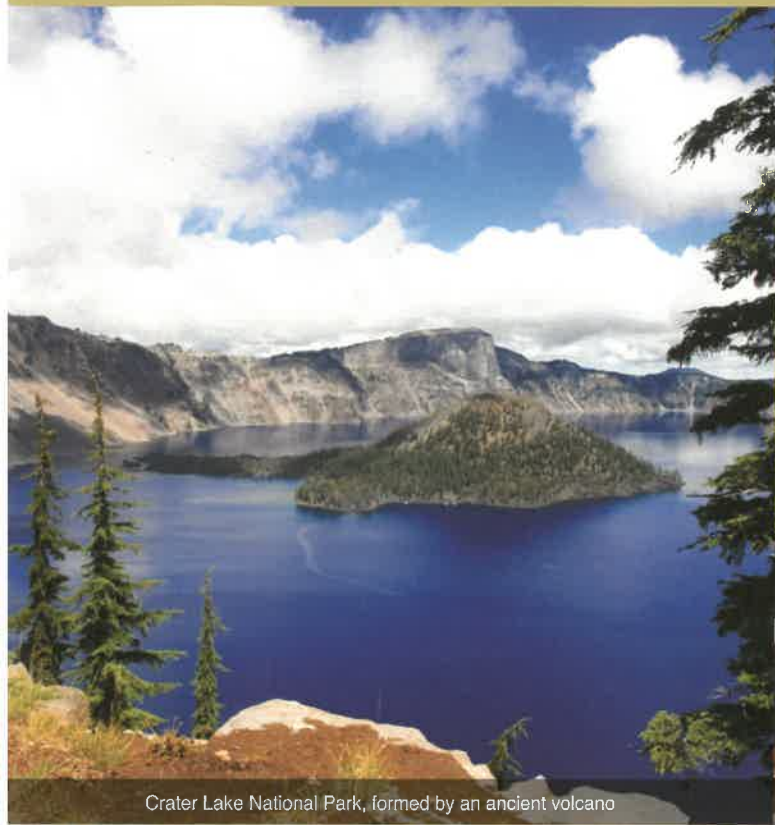
Crater Lake National Park, formed by an ancient volcano