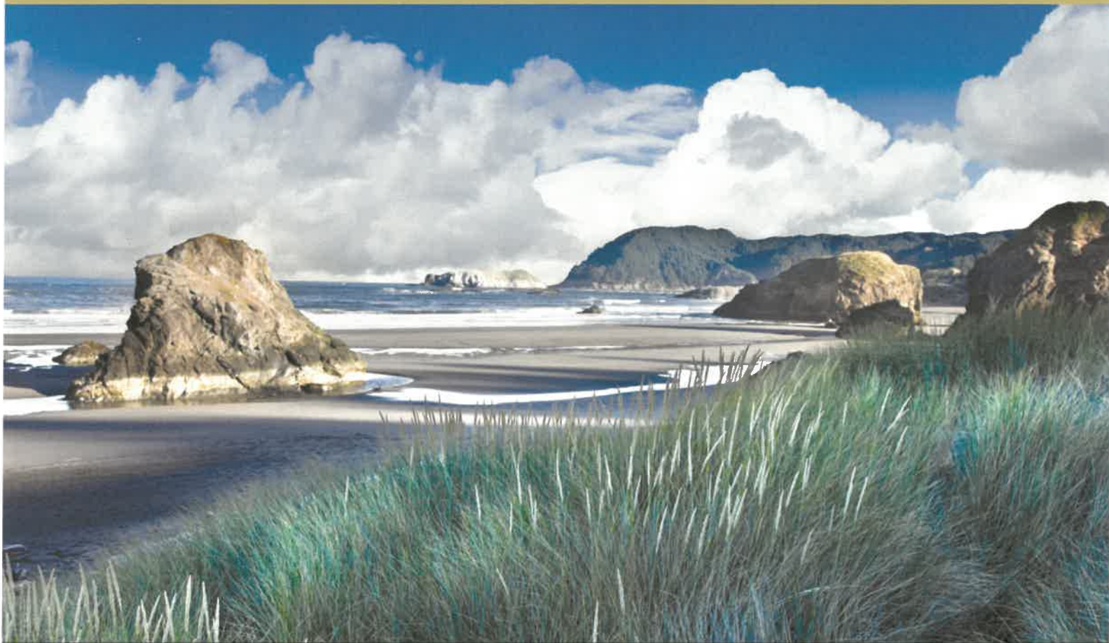
Dramatic scenery along Oregon's Pacific coast