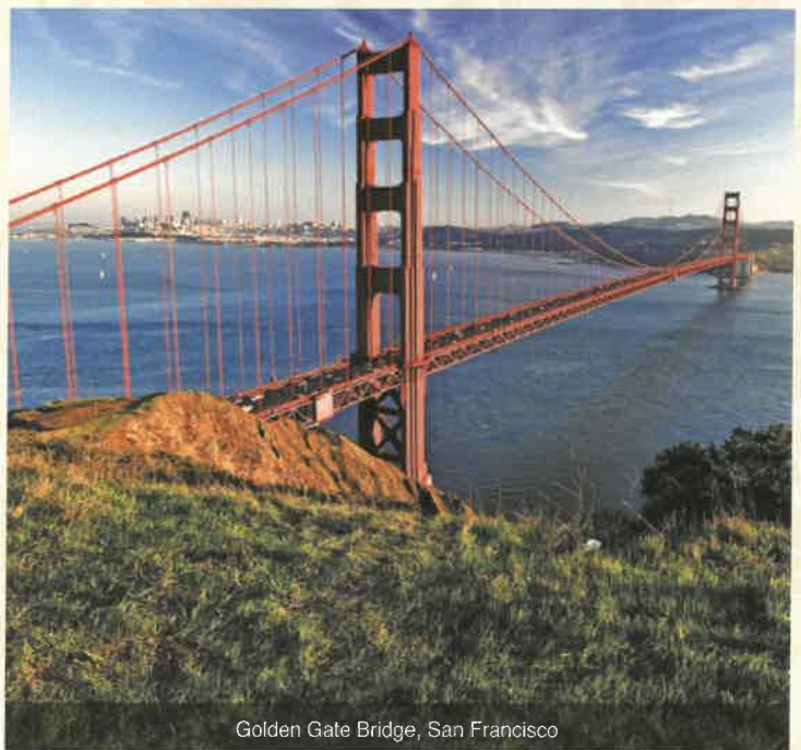
Golden Gate Bridge, San Francisco

Depart for home from this memorable vacation with a group transfer to San Francisco International Airport for flights out after 12:00 p.m. Meal: B