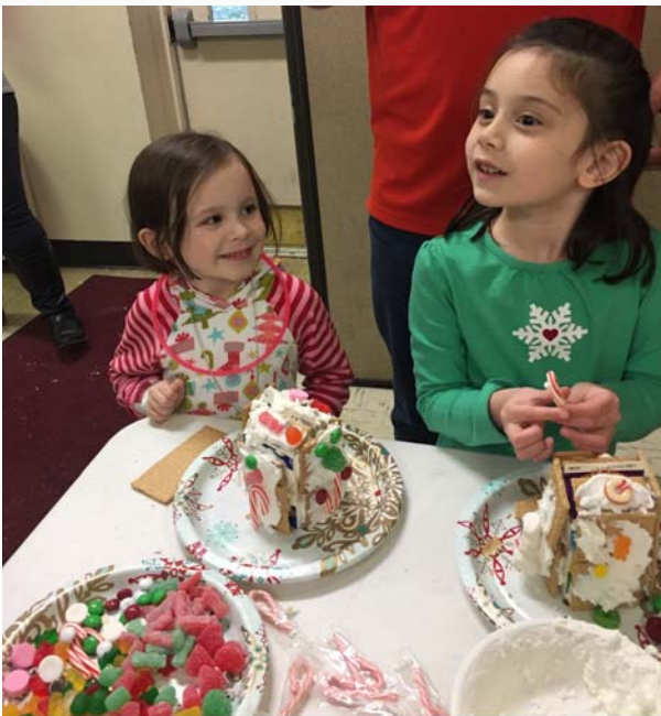
Annual Gingerbread House Making night