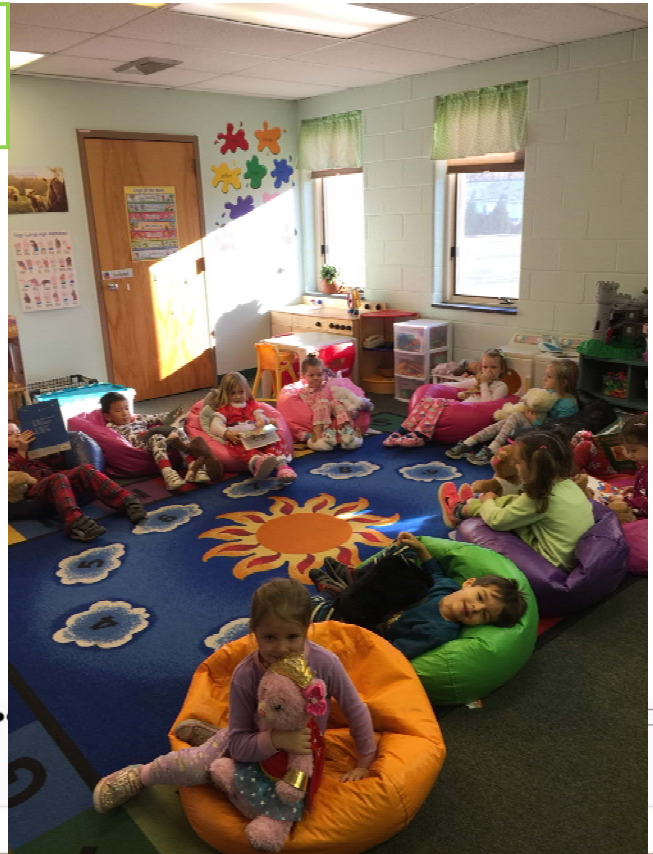
Jammie day at the preschool.