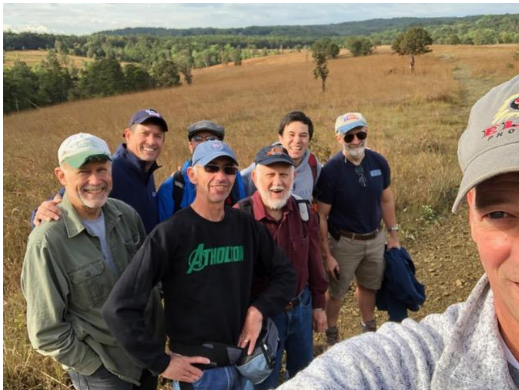
The UMM hike took place at "Soldiers Delight" near Owings Mills on October 13th.

We'll probably plan another trip in the near future, let us know if you care to join us.