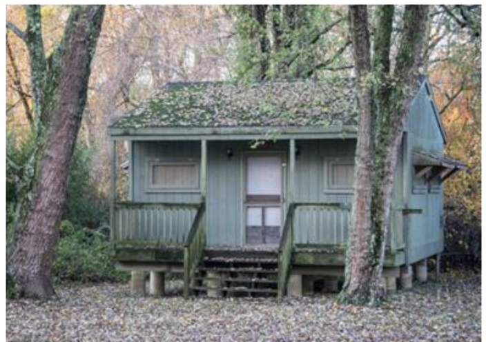
Woodsy Campground Cabin