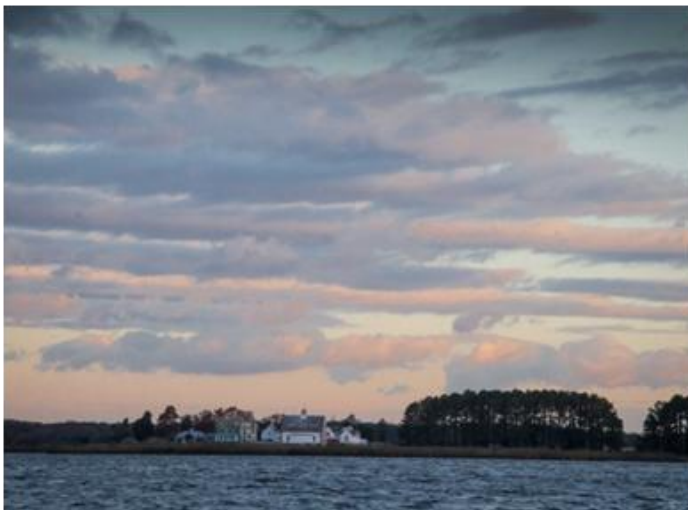
Chester River Sunrise