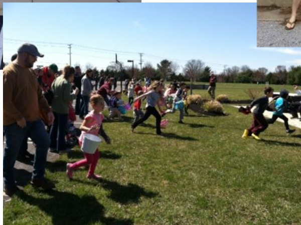
More Holy Spirit at work at Mt. Zion: