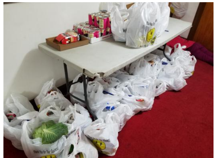
Produce and sides for turkeys delivered to Ames UMC in Baltimore