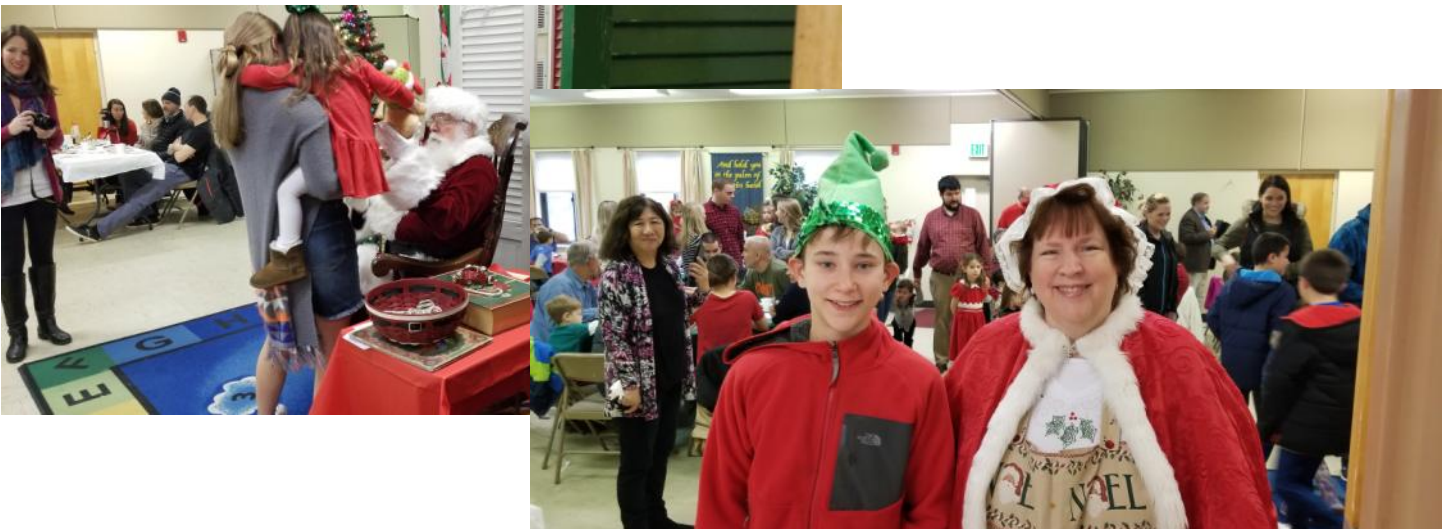
Breakfast with Santa ~ Santa., Mrs. Claus and an Elf!!!