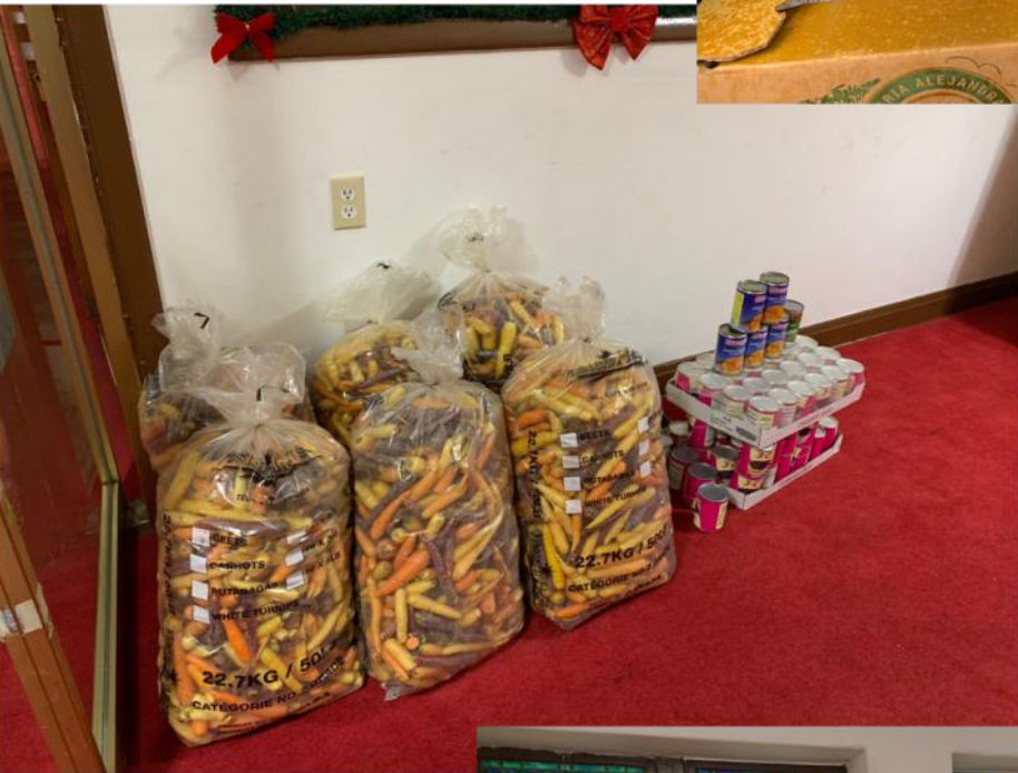
Produce brought into Ames UMC for distribution to people in the neighborhood.