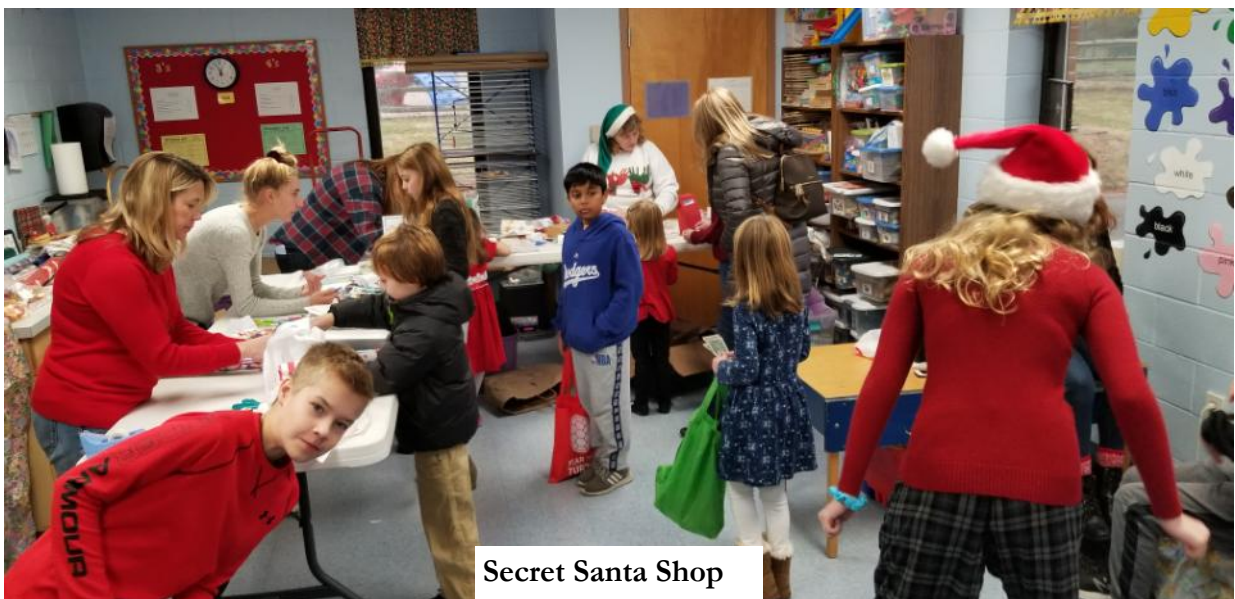
Secret Santa Shop