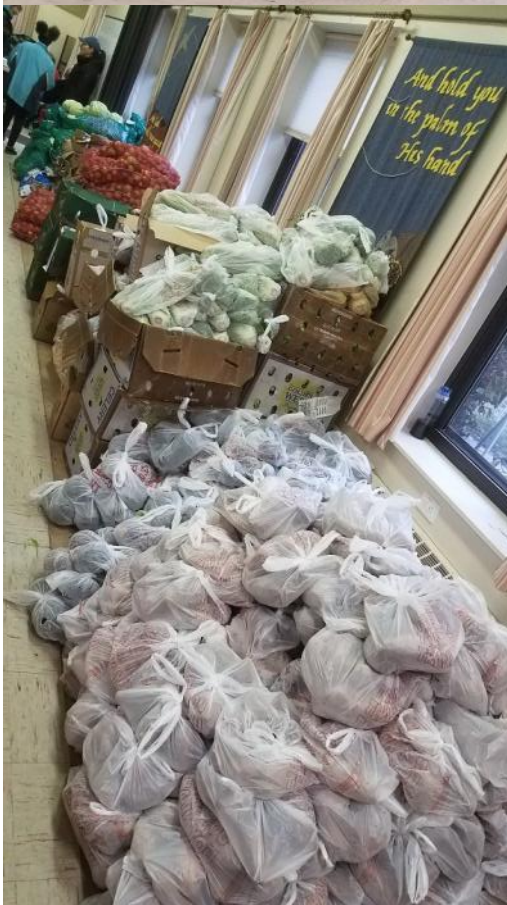
Food Pantry before and after.