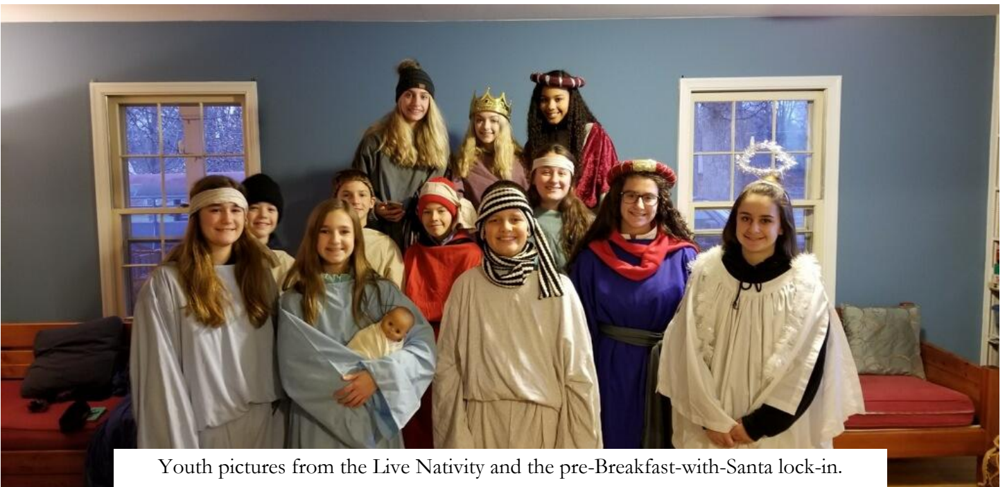
Youth pictures from the Live Nativity and the pre-Breakfast-with-Santa lock-in.