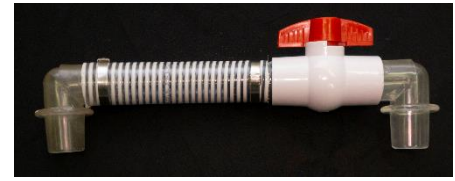
Swing Joint – pictured shorter for clarity, actual length 36 inches