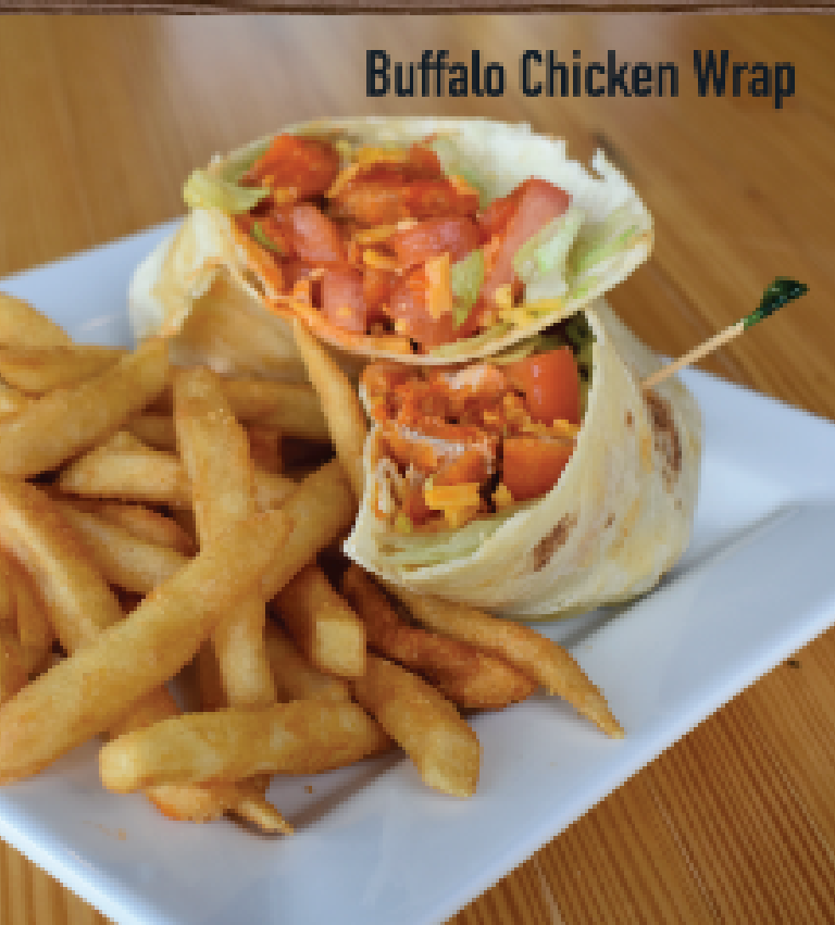
Buffalo Chicken Wrap

Italian style meatballs topped with melted provolone and marinara.