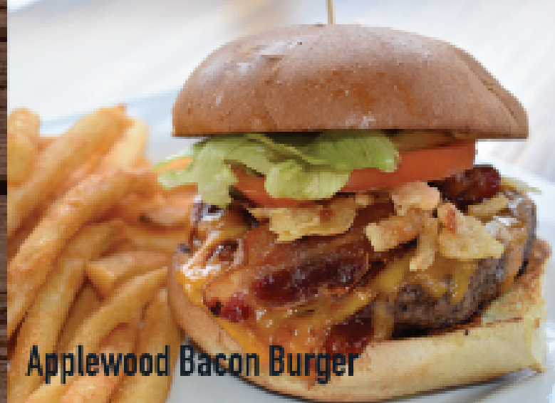
Applewood Bacon Burger