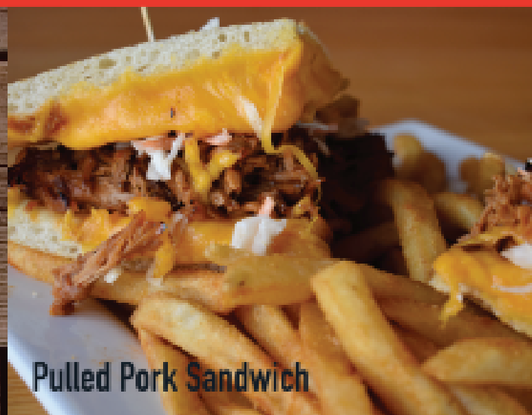
Pulled Pork Sandwich

Fresh salami, capicola and pastrami sliced daily and oven baked with mozzarella cheese, shredded lettuce, caramelized onions, tomatoes and Italian dressing.