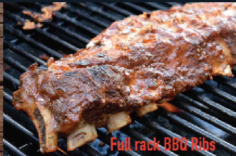
Full rack BBQ Ribs

*Consuming raw or undercooked meats, poultry, seafood, shellfish or eggs may increase your risk of foodborne illness, especially if you have certain medical conditions.