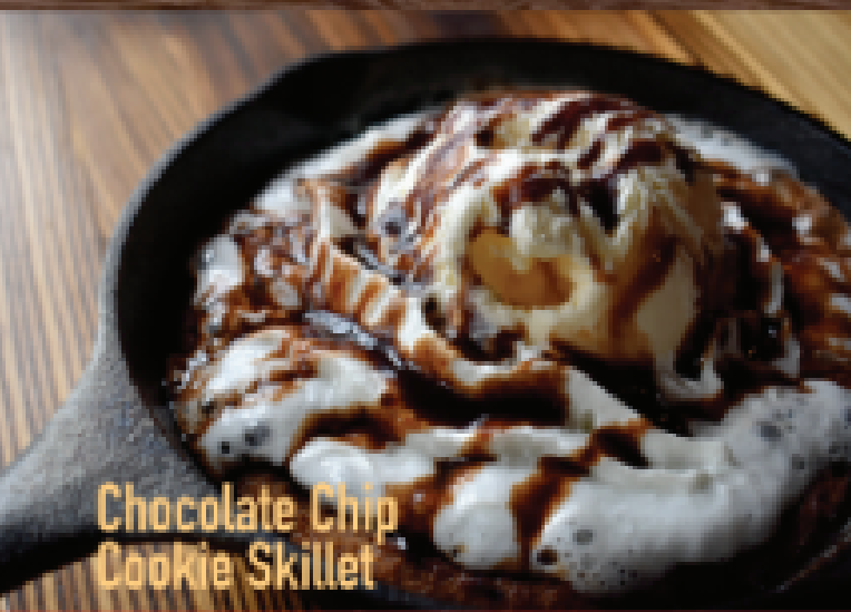
Chocolate Chip Cookie Skillet