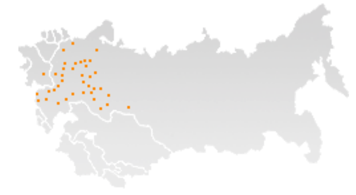
Europe - Russia, Poland, Finland & Spain