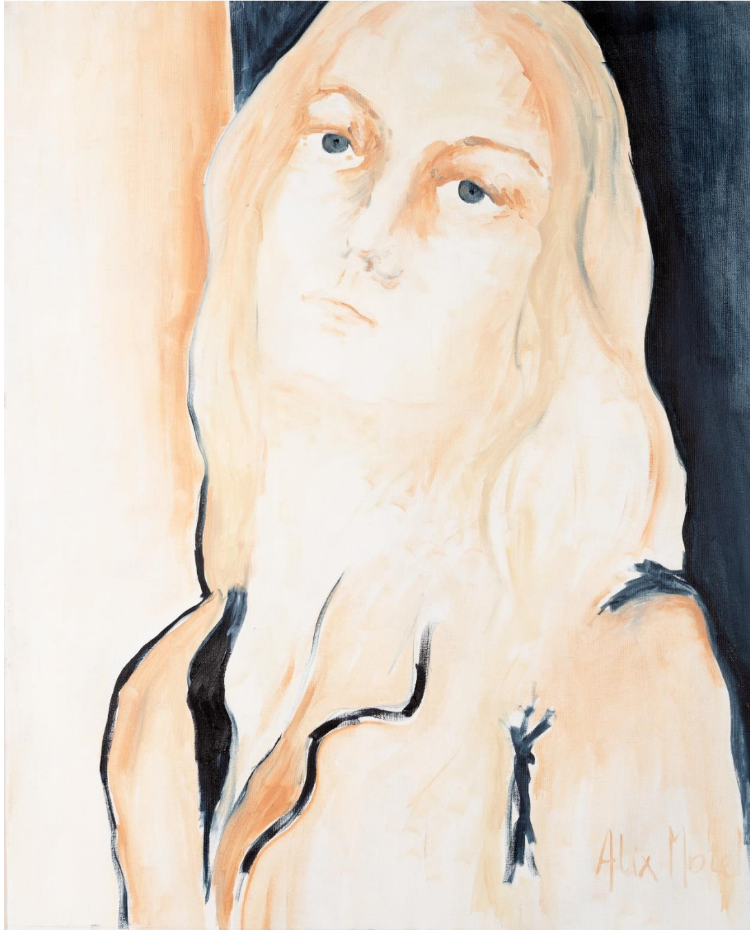
Making Sense #11, Painting