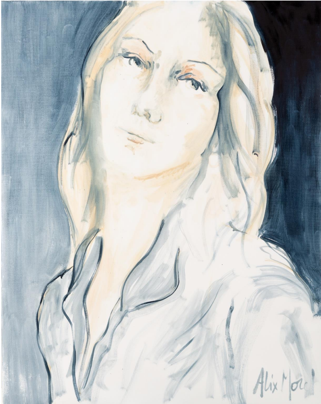
Making Sense #10, Painting