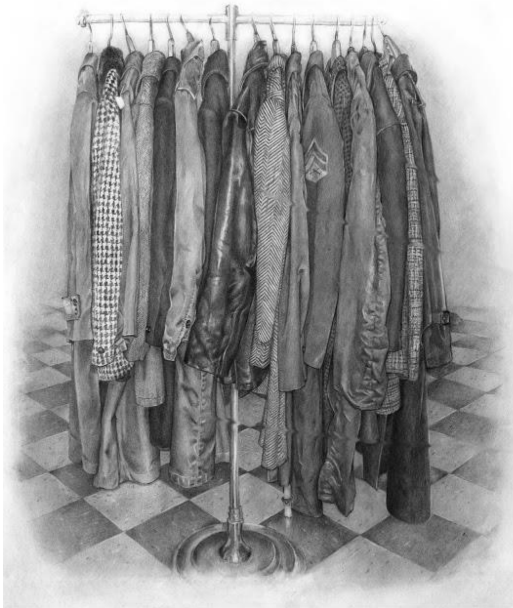
Gathering of Men, Graphite