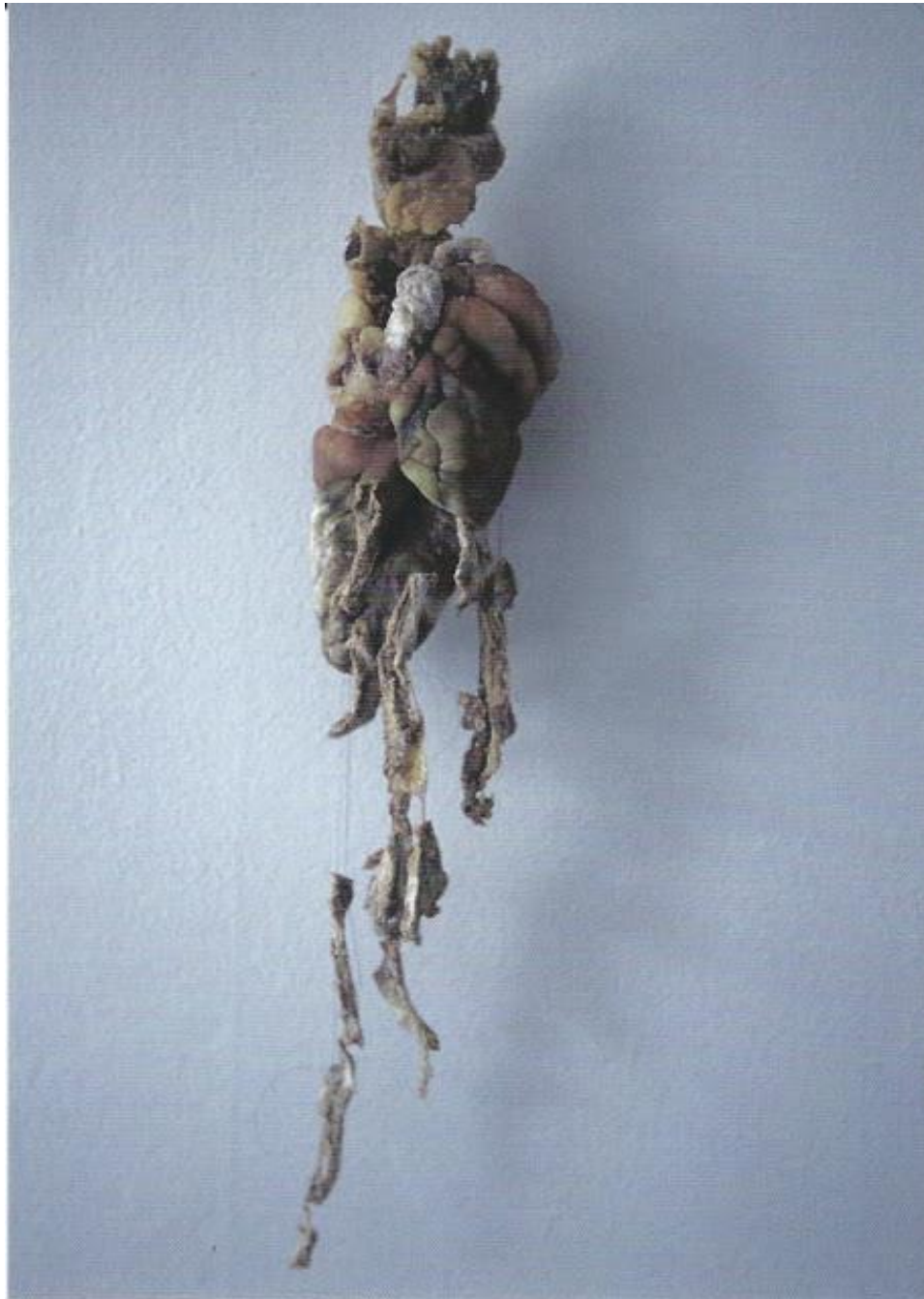
Heart Jerky Series, dried sheep heart, hair, nail, salt