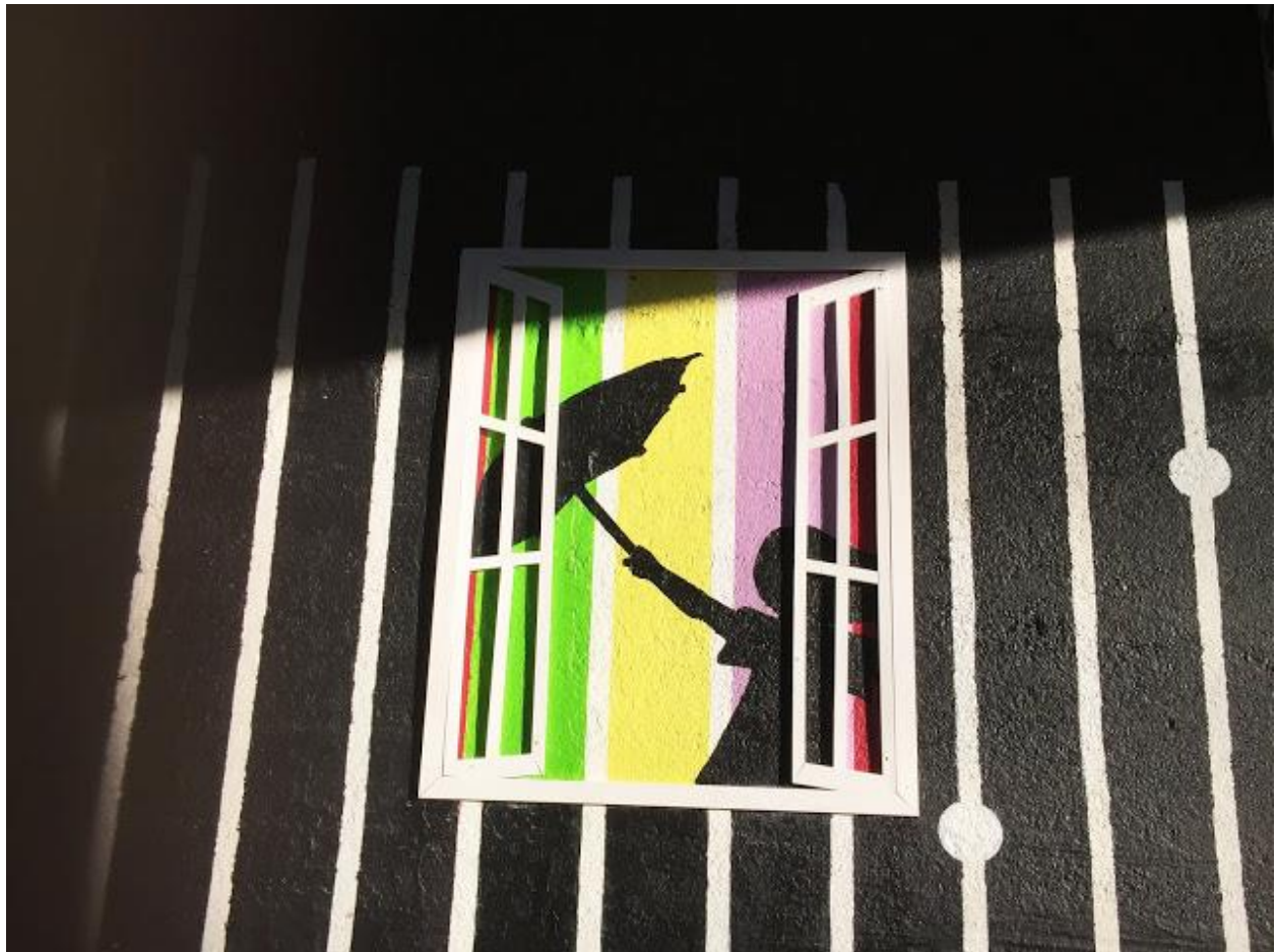
2017 Freedom. Fleet Street. Self., 150 feet x 10 feet, mural