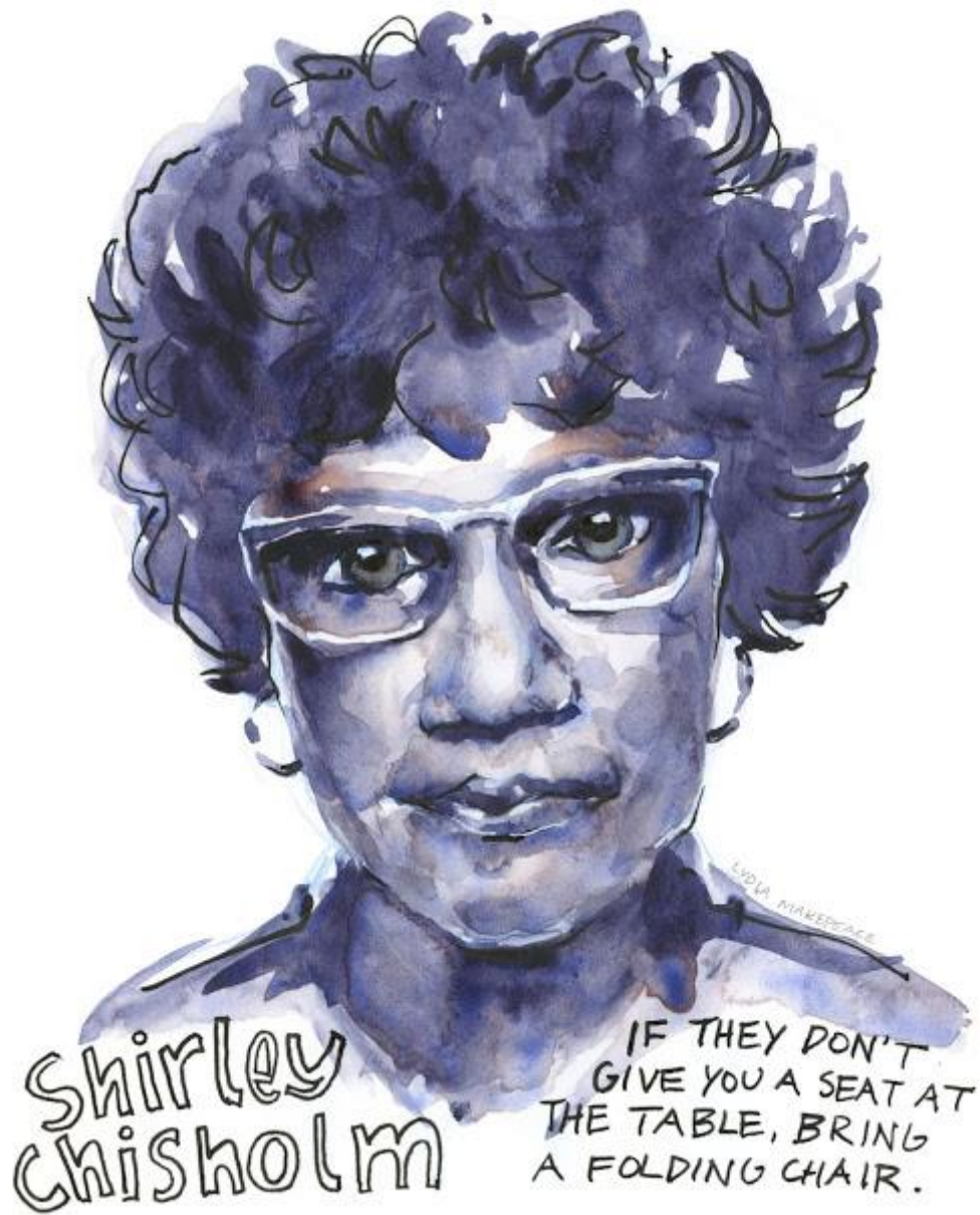
Shirley Chisholm, Painting