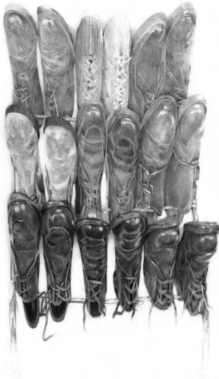
Many Miles, Graphite