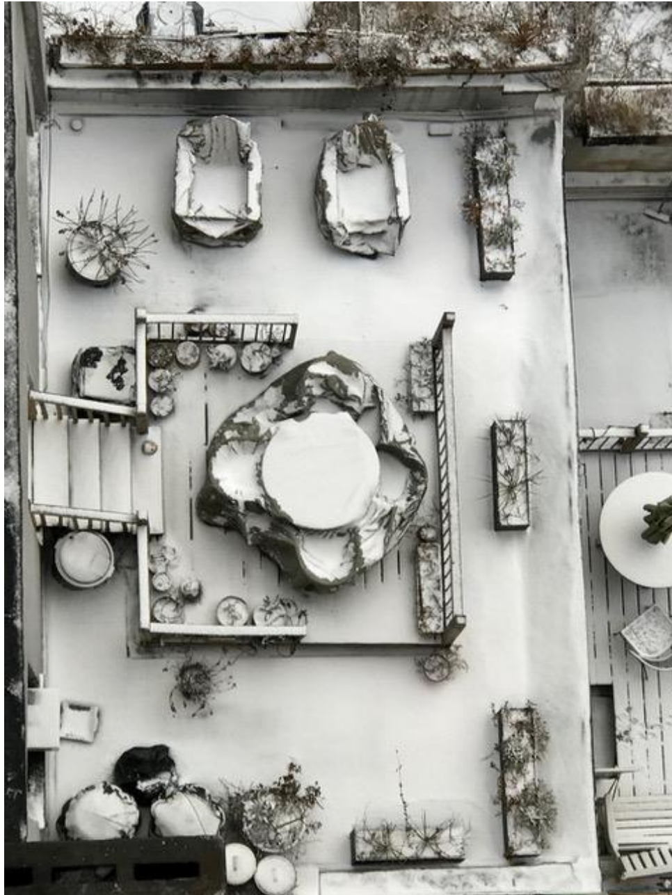
Winter Rooftop, Photography