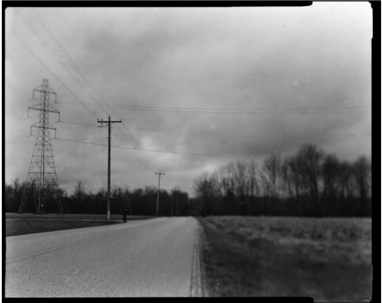
Country Road, Photography