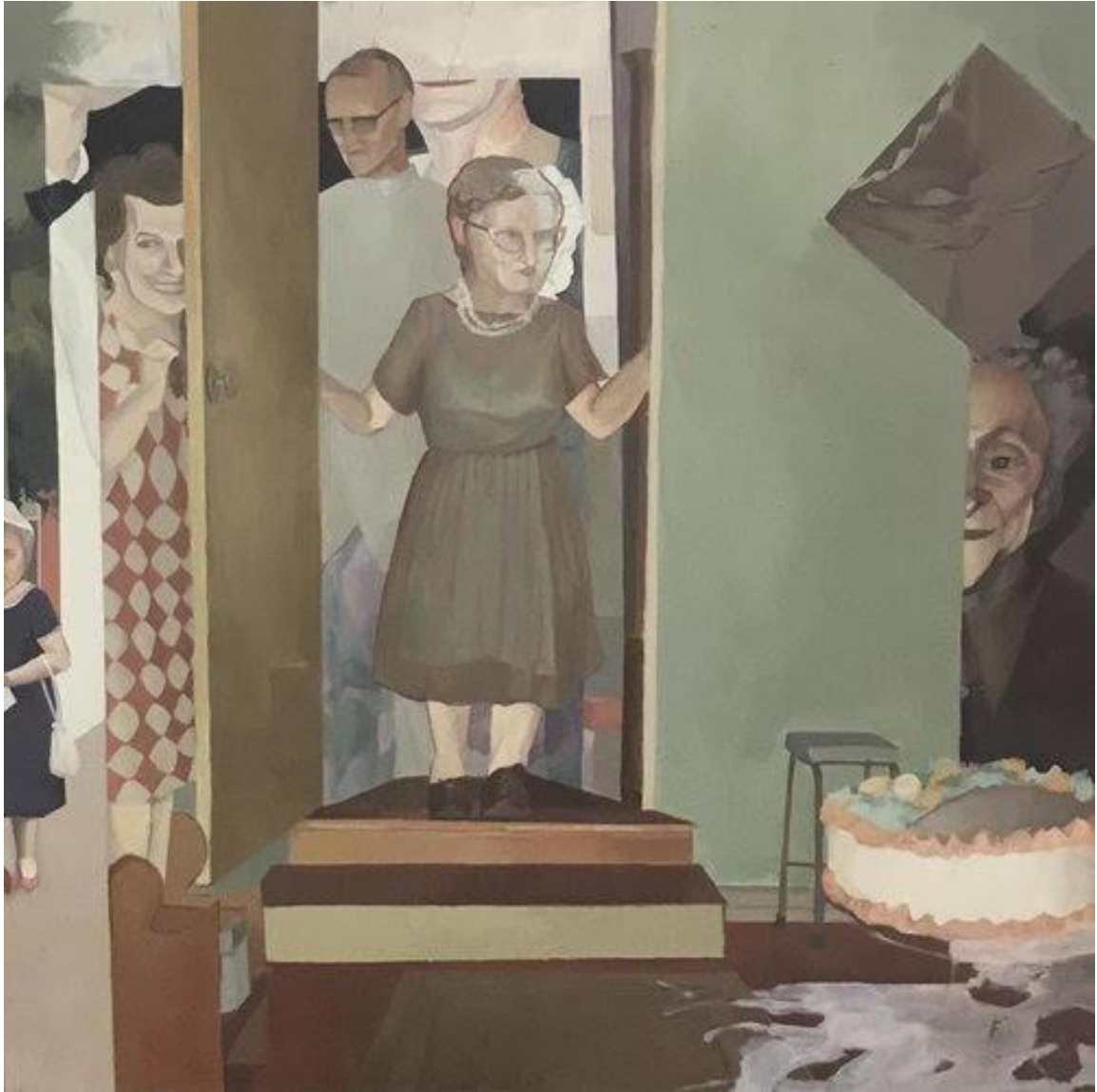
In Lieu of Testimony, No. 3, Paint