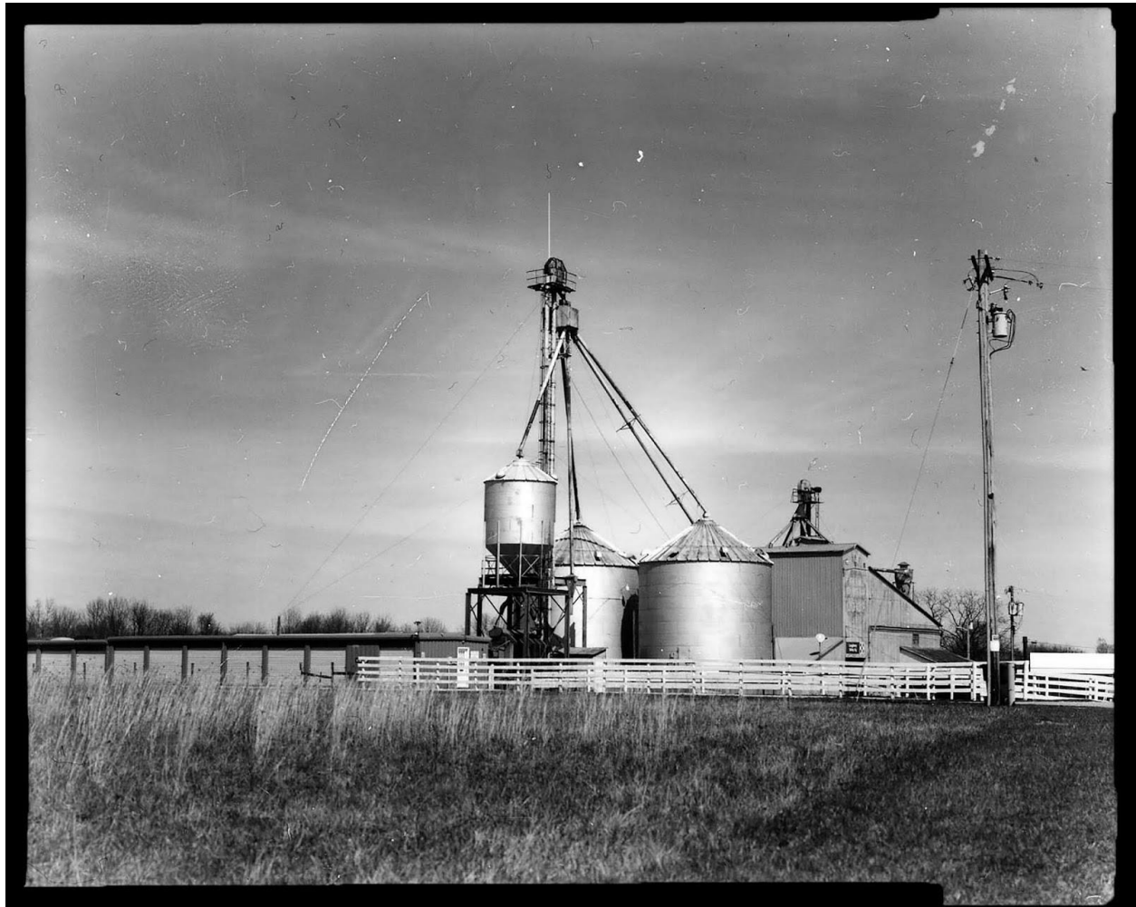
Grain Silo, Photography