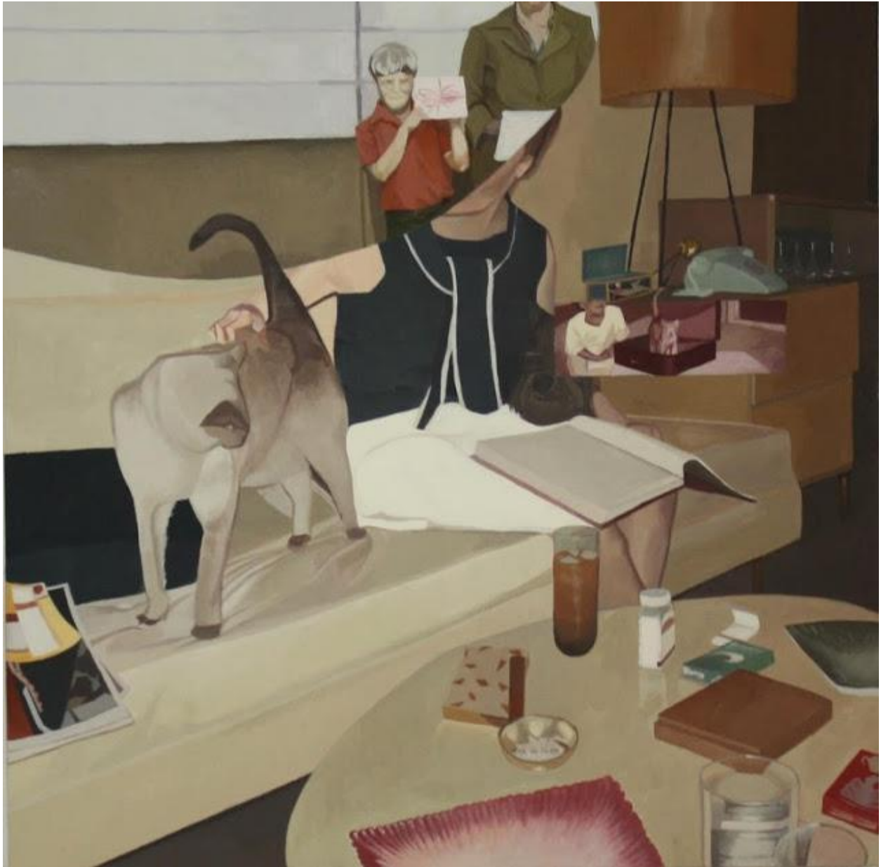
In Lieu of Testimony, No. 1, Paint