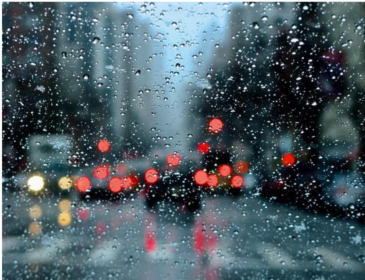
Rain - Fifth Avenue, Photography