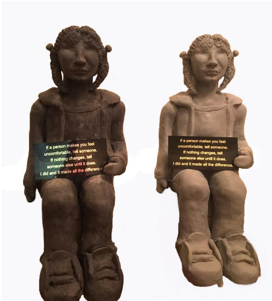
A Simple Act: Sitting, Clay