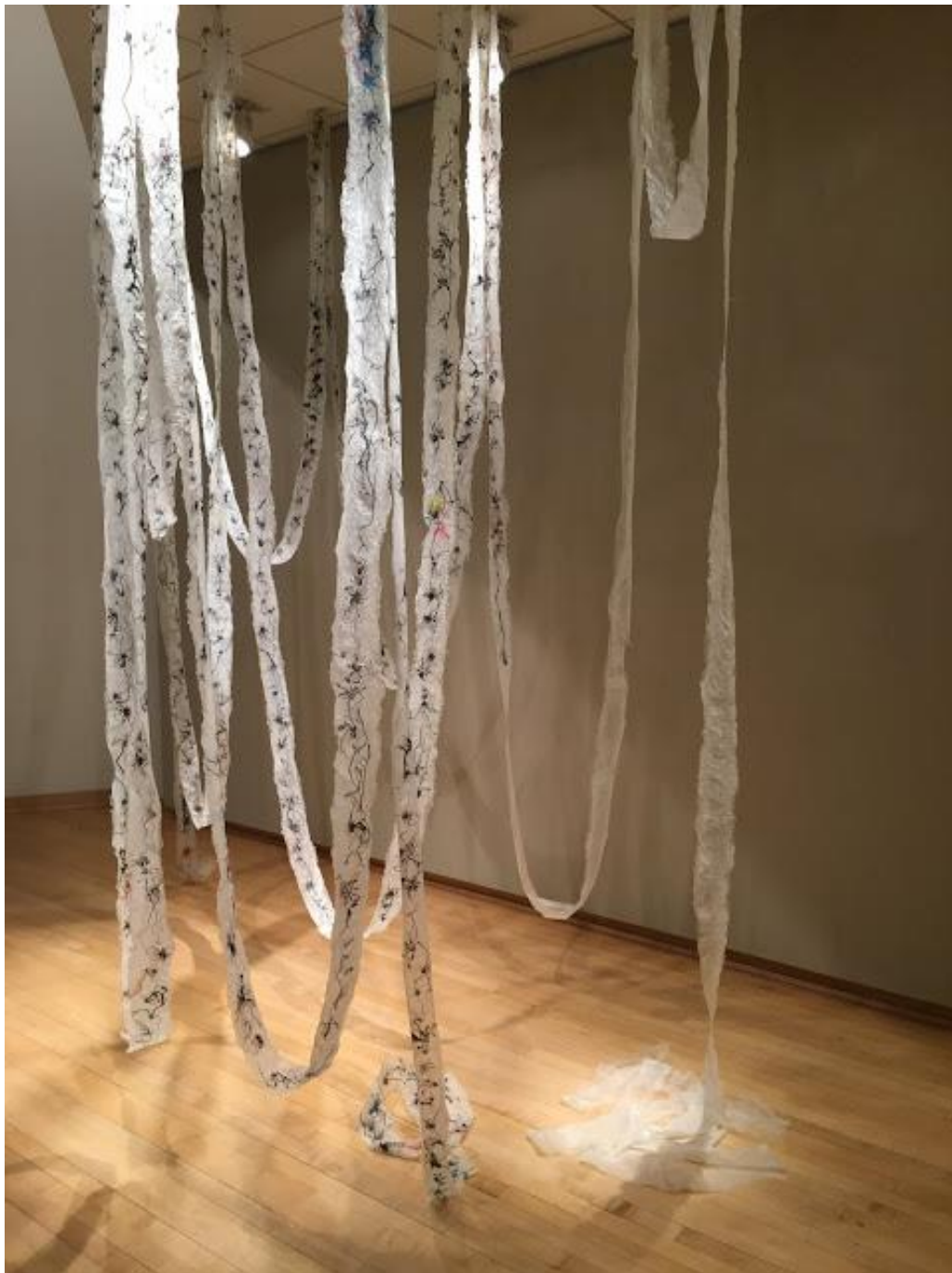
Exhale, gut, mat medium and ink