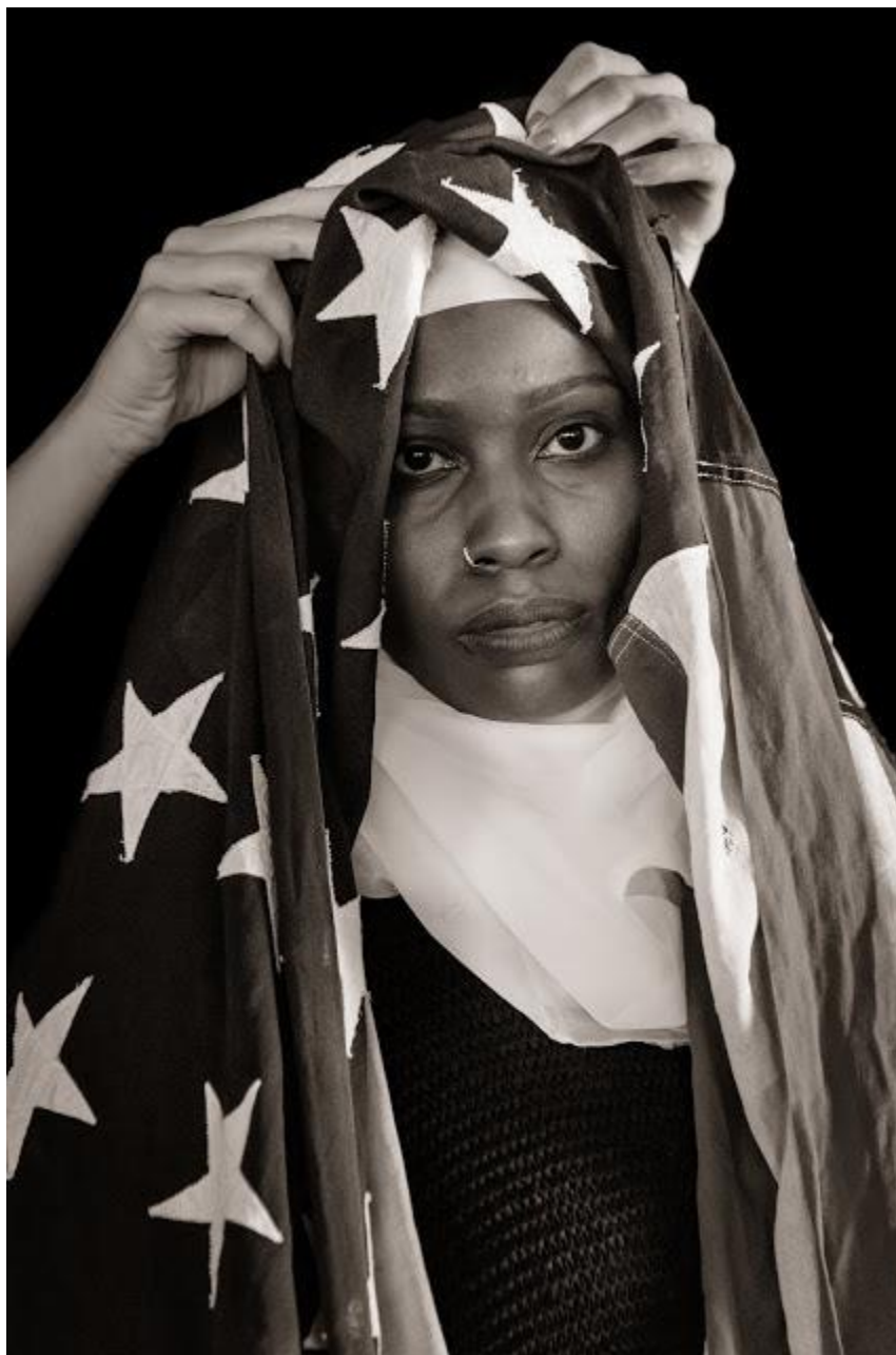
I Am My Own Witness: Sufiyyah.13, Photography