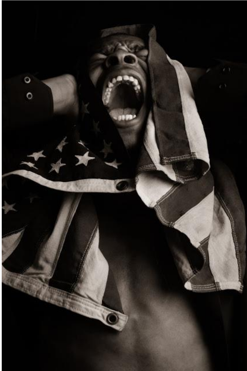
I Am My Own Witness: Messiah.9, Photography