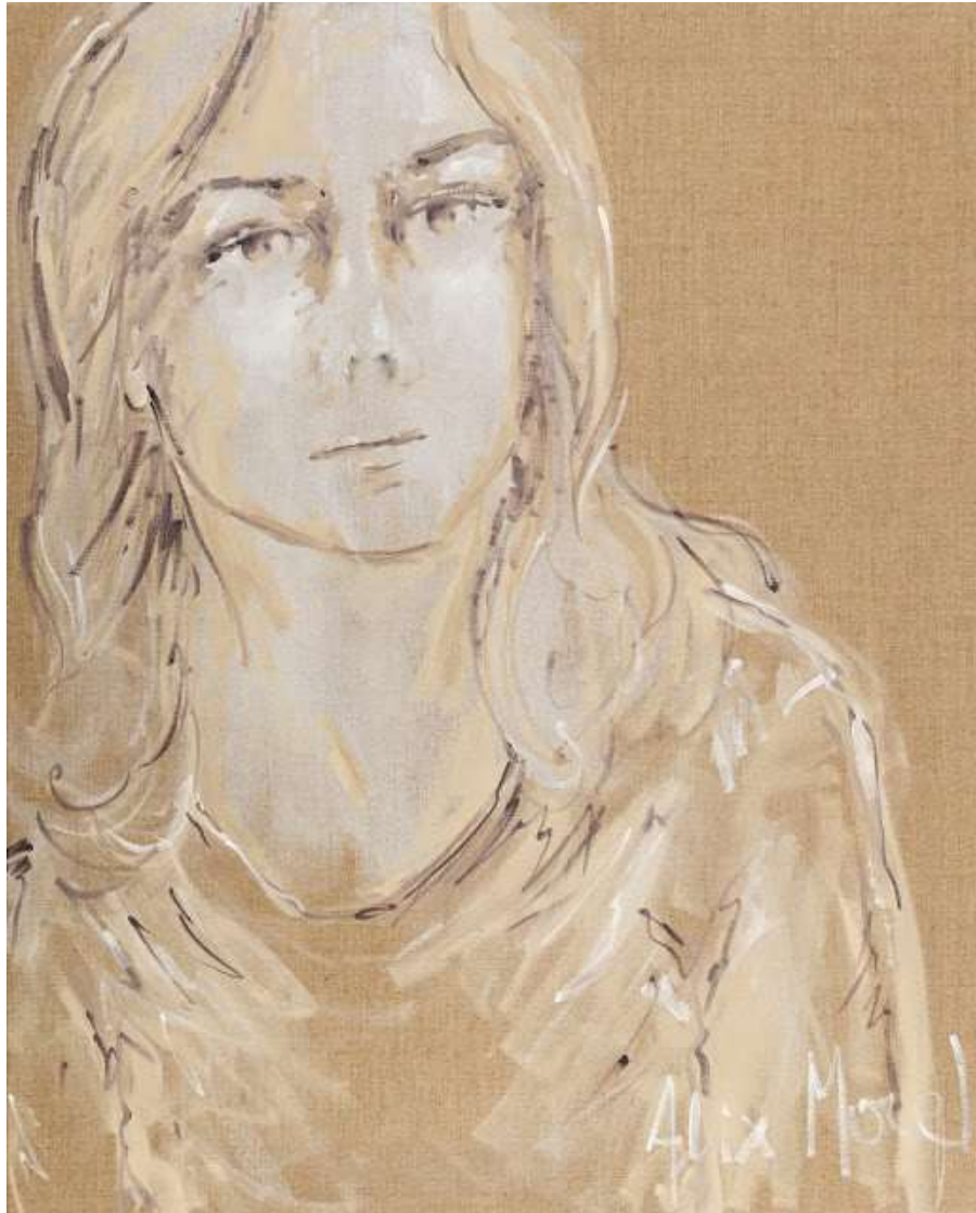
On the Edge #10, oil on canvas, 2019, 81 x 65 cm

The “On The Edge” addresses those fleeting and ephemeral moments. These are inspired by those times when we are perched on the edge, determining the tipping point of our life.