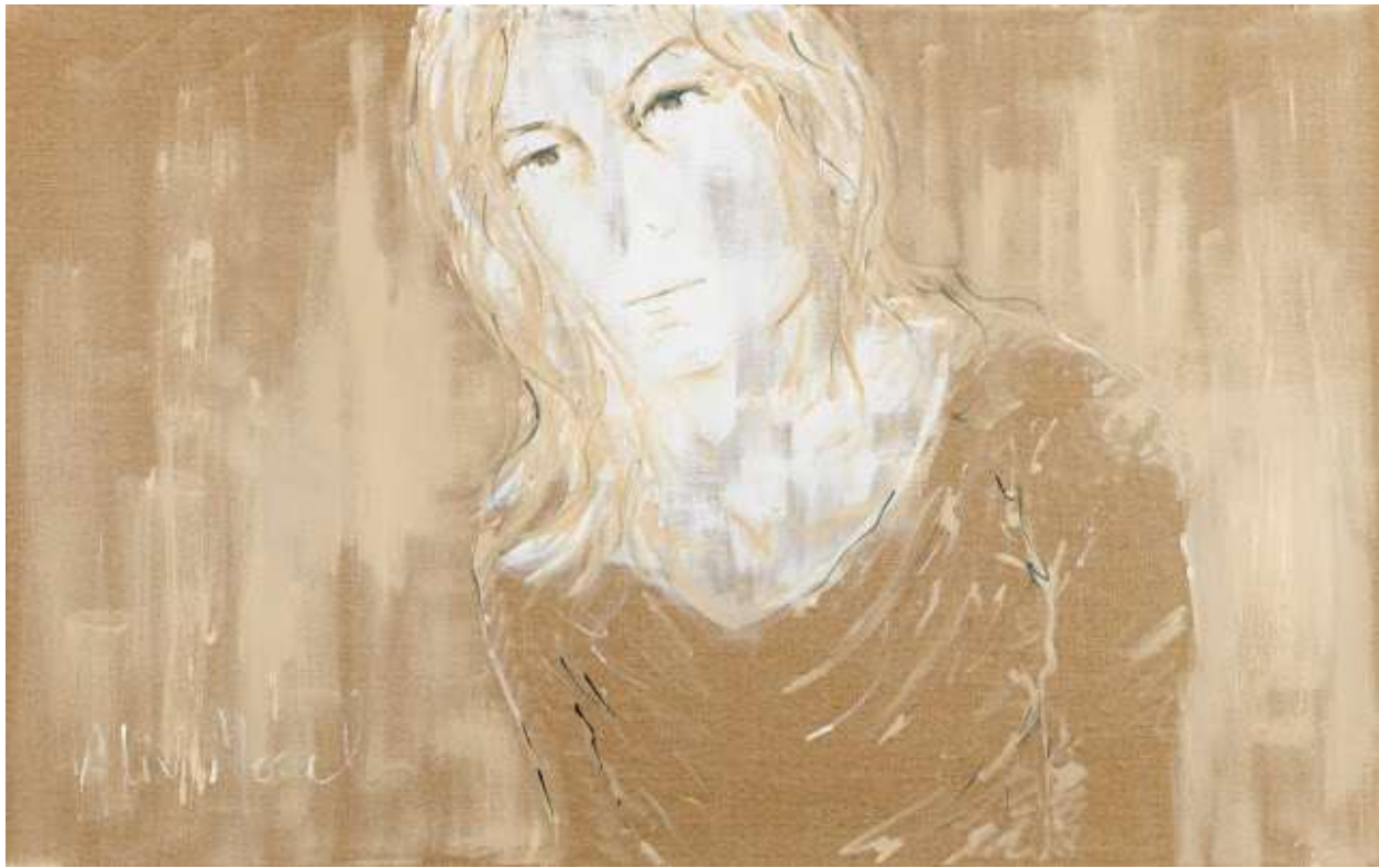
On the Edge #14, oil on canvas, 2019, 130 x 81 cm