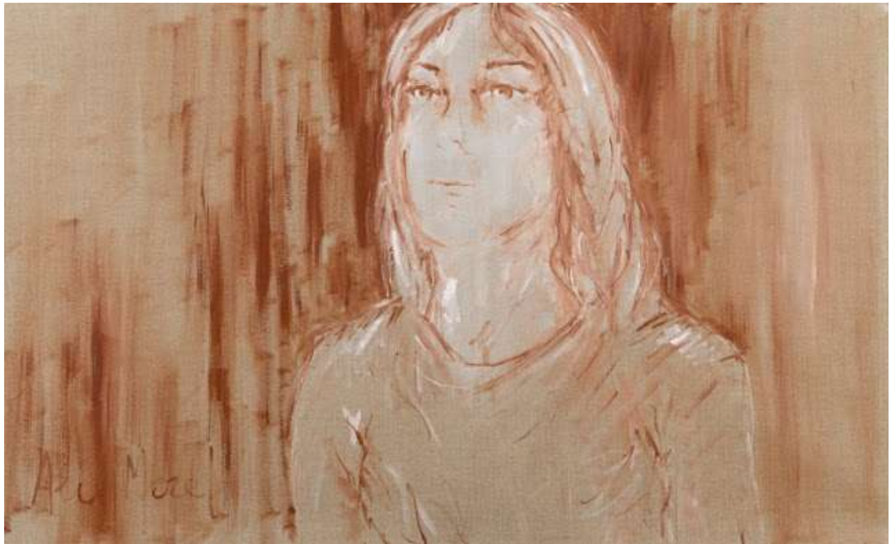
On the Edge #7, oil on canvas, 2019, 51x 31cm