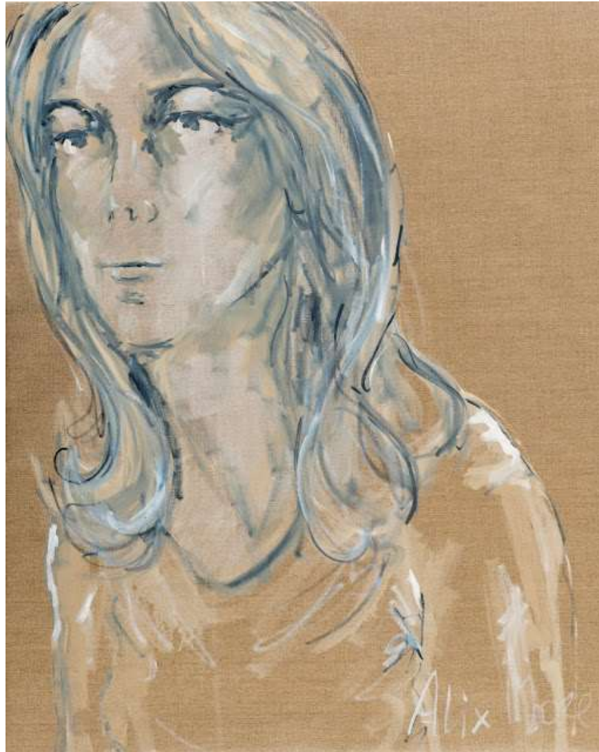
On the Edge #13, oil on canvas, 2019, 81x 65cm