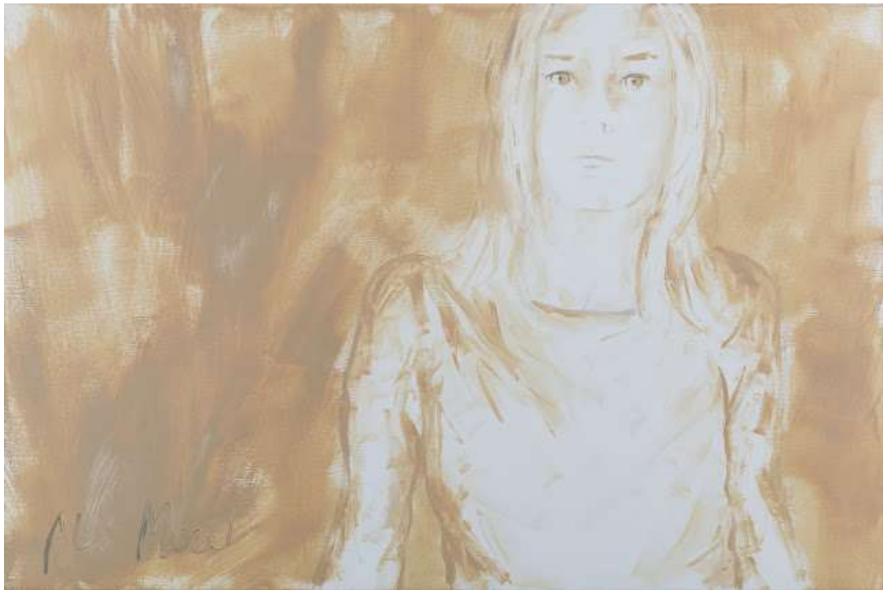
Making Sense #4, oil on canvas, 2019, 81 x 54 cm

After having graduated from Amiens University Of Fine-Arts, I studied in L'Aquila Academy of Fine-Arts, Italy.