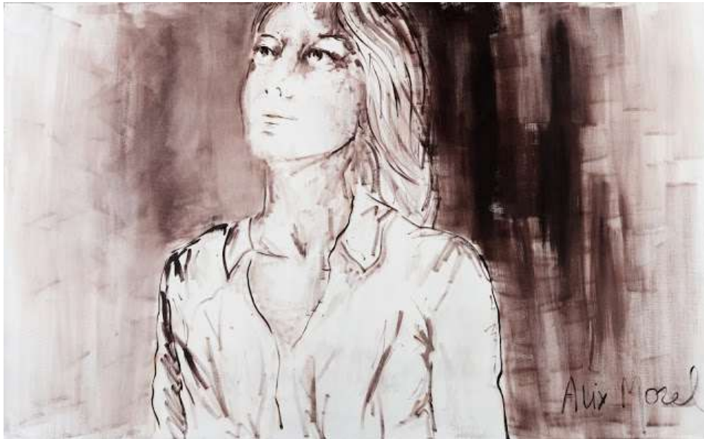
Making Sense #8 (above) #9 (below), oil on canvas, 2019 130 x 81cm