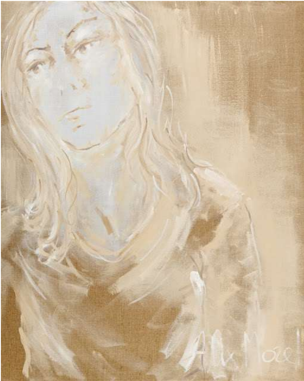
On the Edge #12, oil on canvas, 2019, 81 x 65 cm

This rich and fascinating period in history is a constant reference in my work as well as in my research about colors, compositions and design.