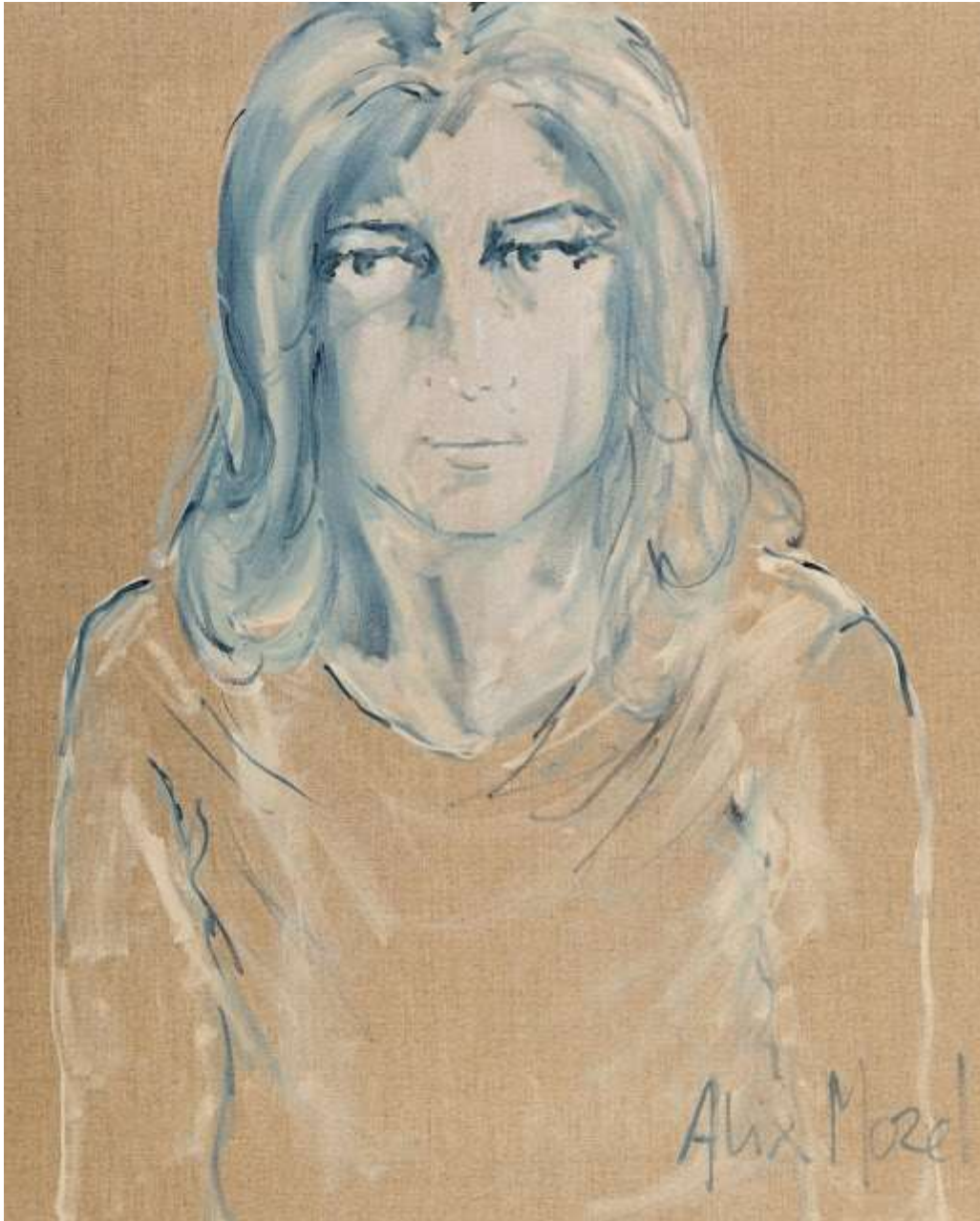
On the Edge #11, oil on canvas, 2019, 81 x 65 cm

2017 - Before summer..., collective exhibition, BERGAM Galerie, Amiens, France