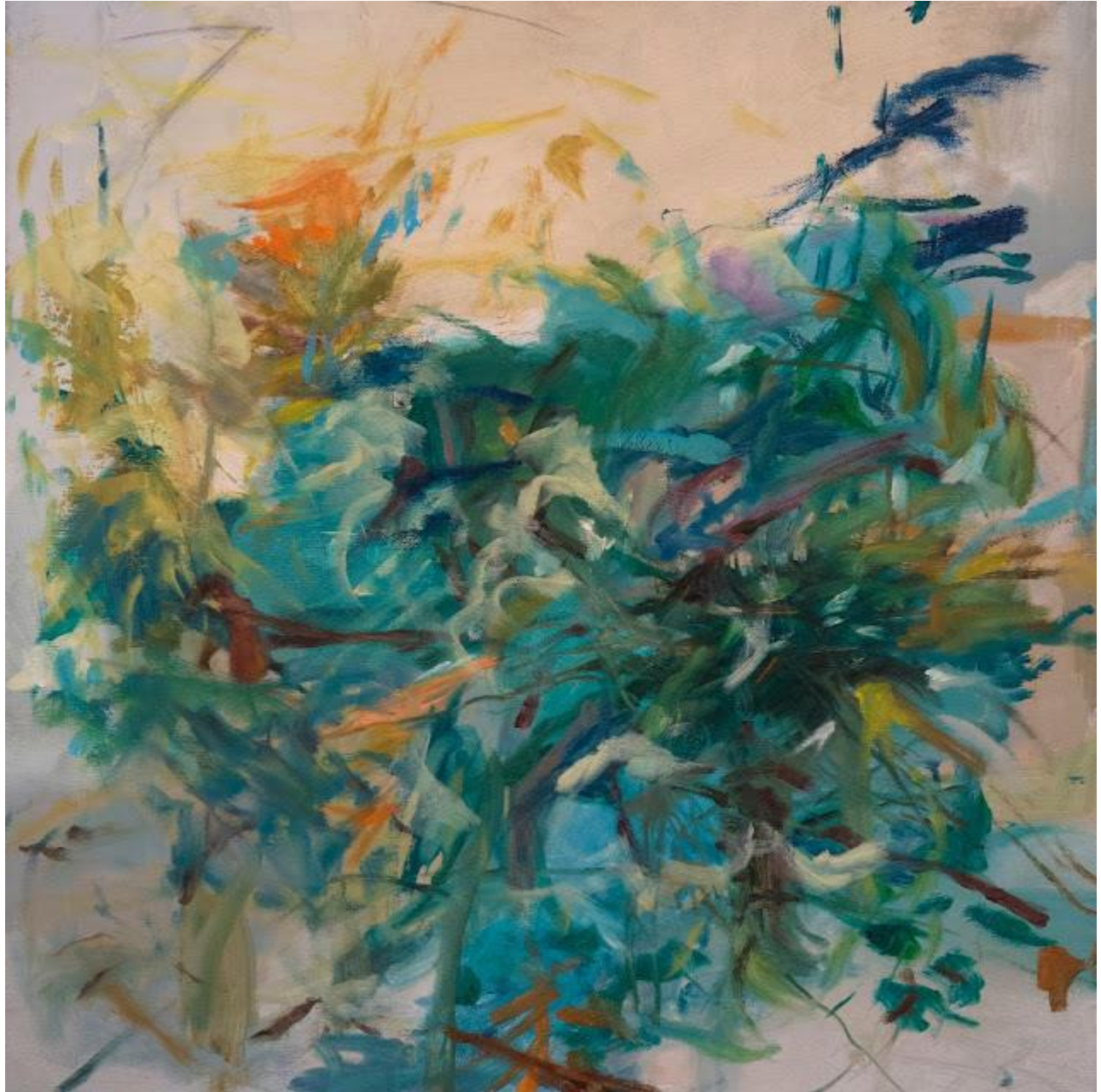
A Secluded Retreat

The Fat Canary Journal is happy to share them with you on these first days of autumn.