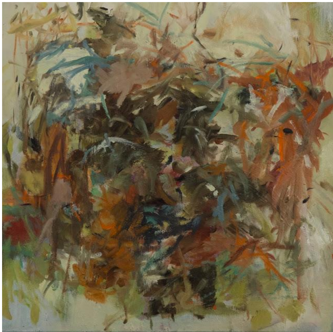
Further to Fly