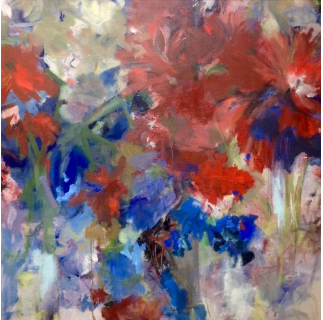
Indigo to Crimson