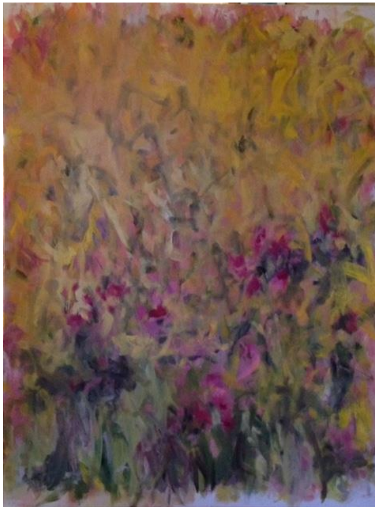
For the Love of Freedom

I have been studying and examining nature my entire life and the more I learn the more abstract it appears to me. As a young child I lived on a 700 hundred acre arboretum on Long Island, NY, for 10 years. That experience is rooted in my soul existence. As I matured I’ve become aware of the significant and extraordinary impact that time was for me.