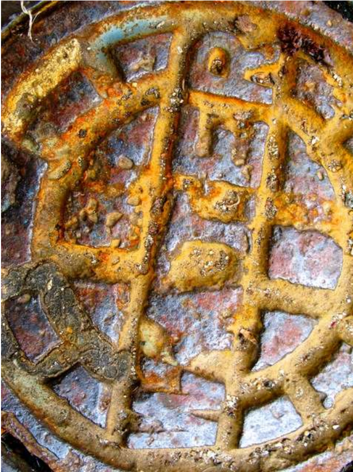
Gas and Water Caps