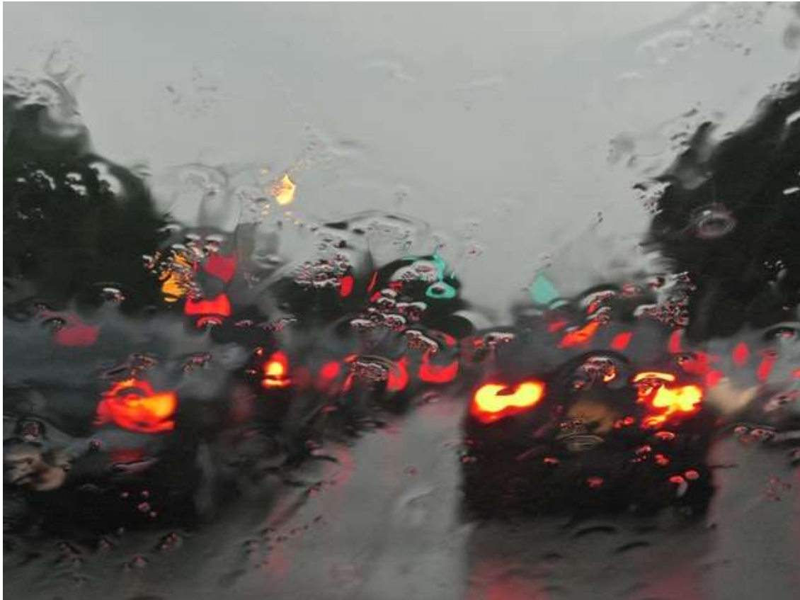
Rain - West Side Highway