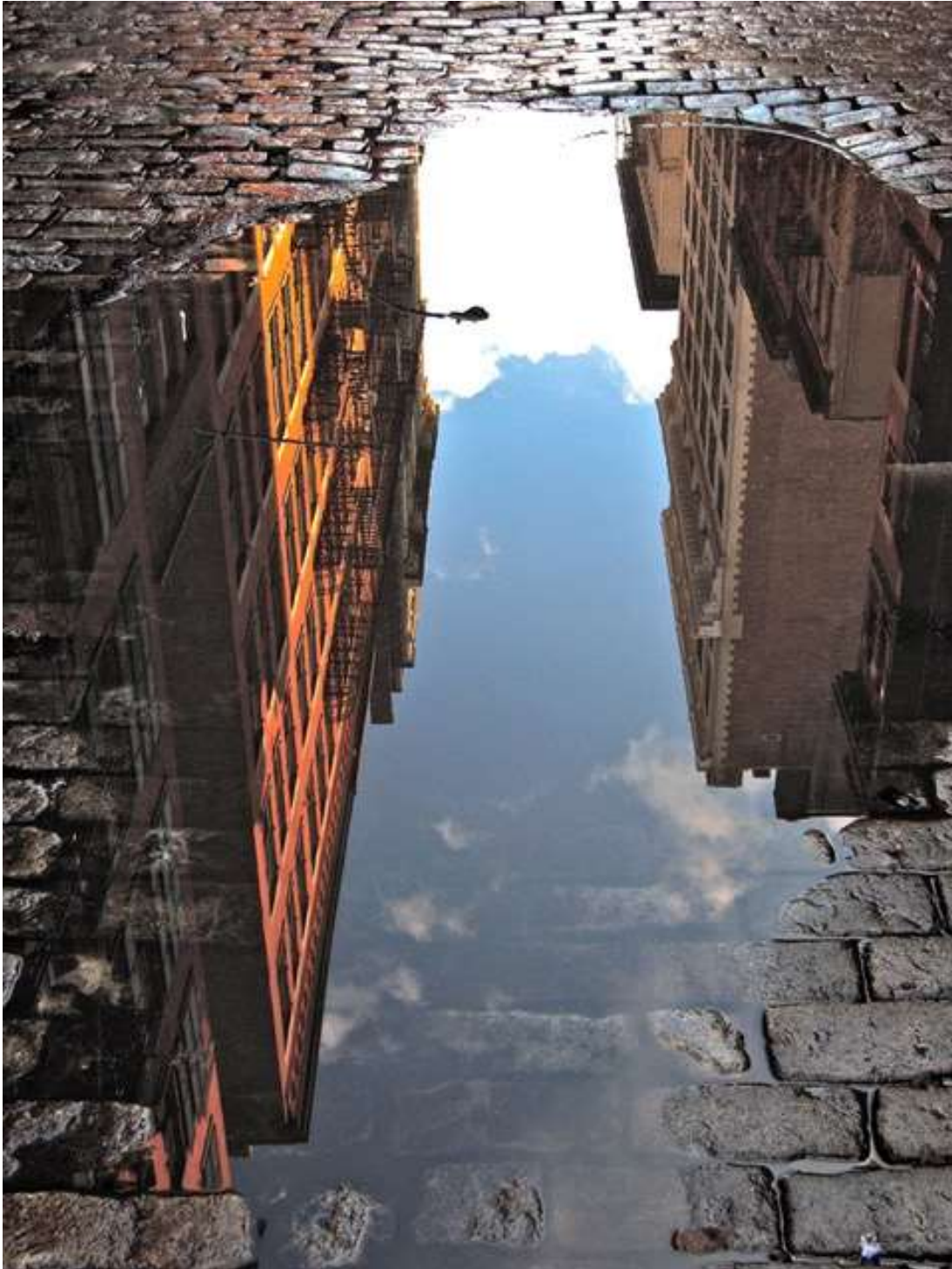
Puddle Reflections- Crosby Street