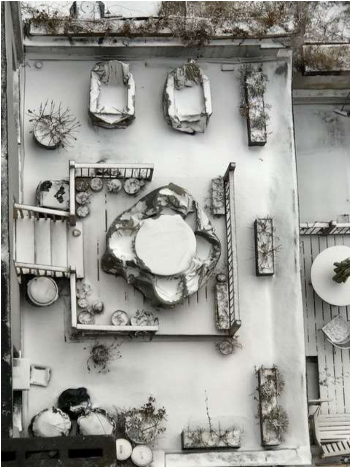
Winter Roof Top