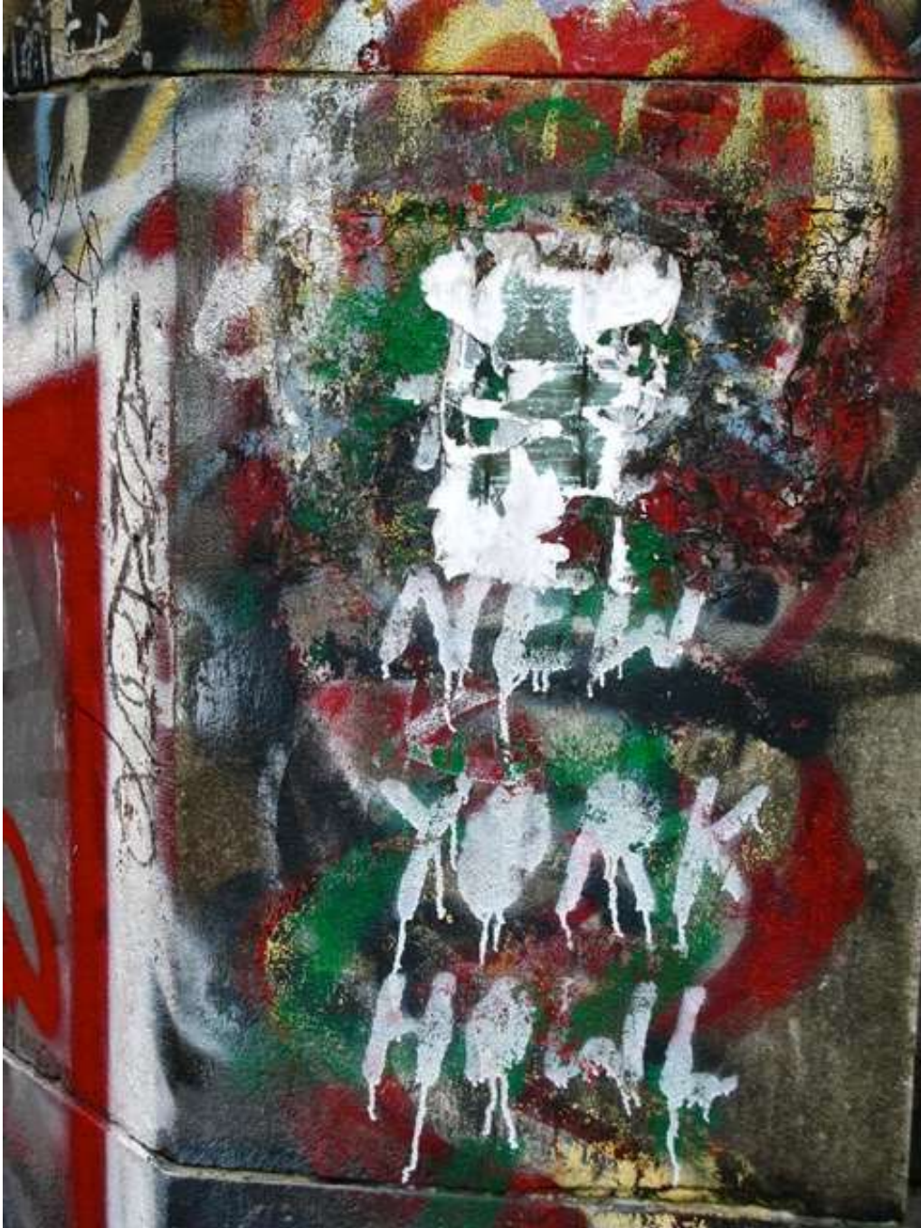
Graffiti - New York Howl