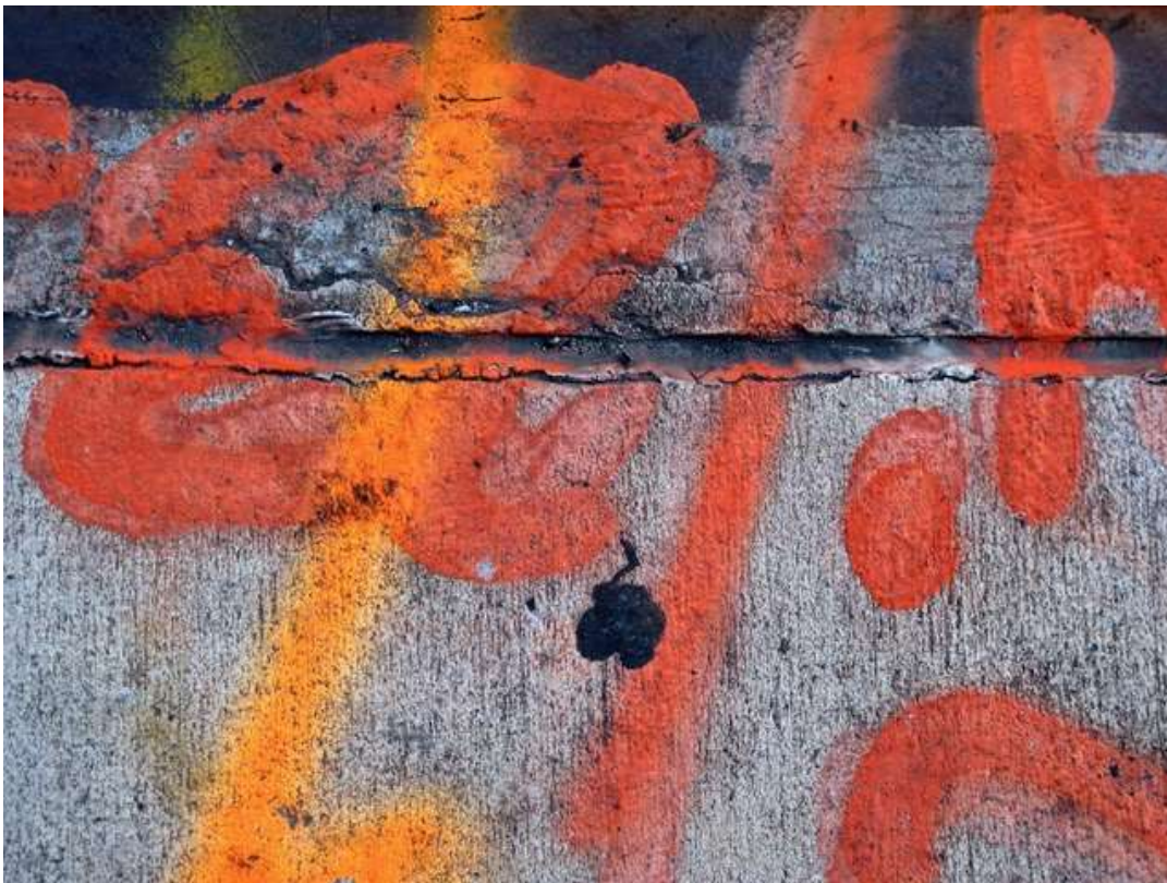
Street Seen - Con Ed Markings