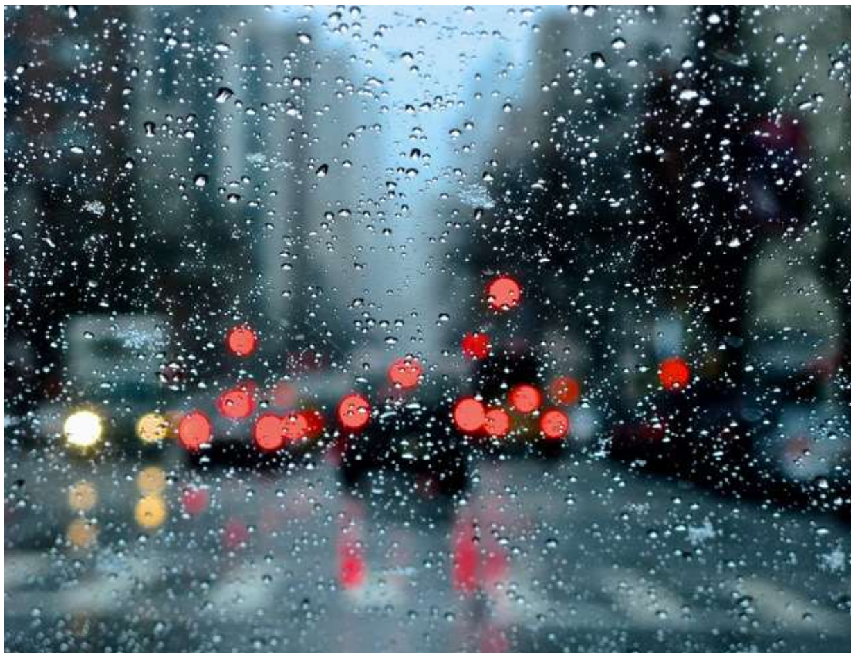
Rain - Fifth Avenue