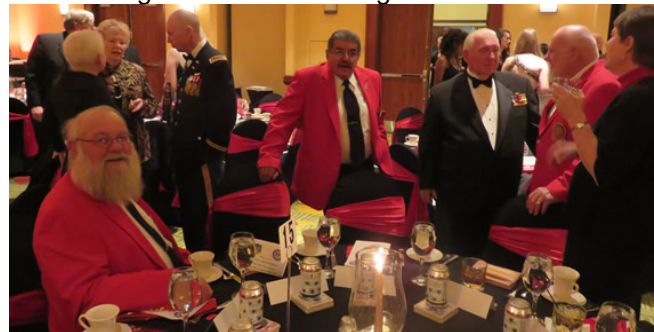
240 th Marine Corps Ball

8 December 1941: Japanese aircraft attacked Wake Island within hours of the fateful attack on Pearl Harbor. Marines of the 1st Defense Battalion and Marine Fighting Squadron 211 resisted Japanese invasion attempts for over two weeks before finally succumbing to an overwhelming force.