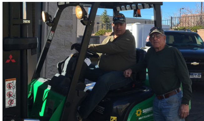
Working at the Toys for Tots Warehouse