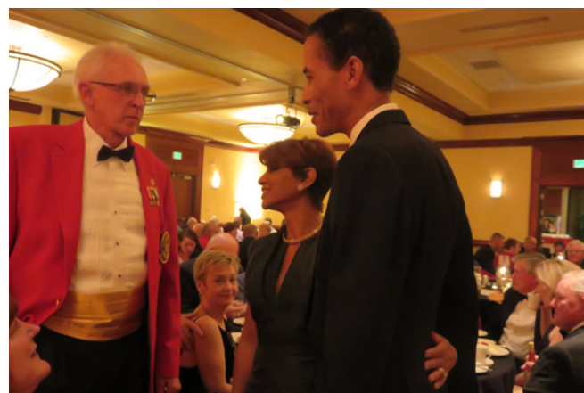
240 th Marine Corps Ball