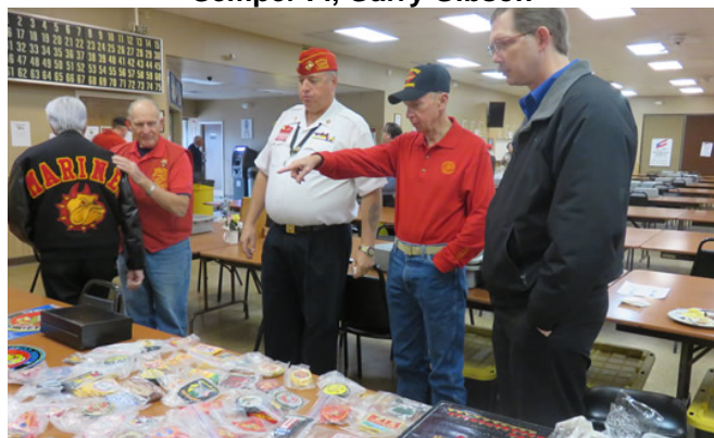
Cash Sales at the November Meeting