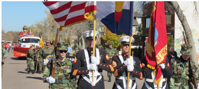
Veterans Day Parade