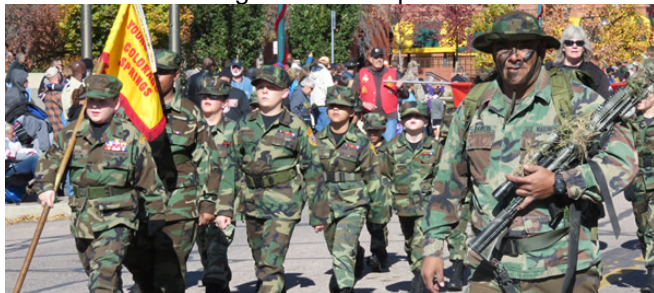
Veterans Day Parade