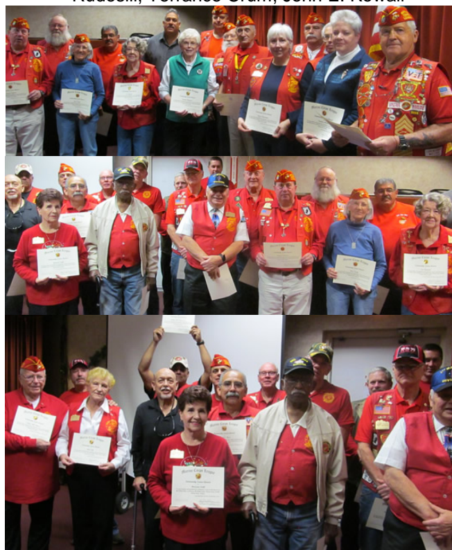
Community Service Award Lots of Participation from Detachment Members throughout the Year!!!