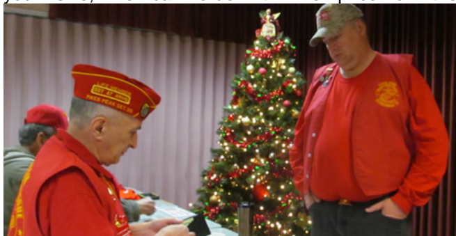
Cash Sales at the December Meeting

help liberate the hard-earned money from the pockets of our members in exchange for more covers, pins and patches to stuff their closets with? I am looking for a volunteer to help out during the meetings. Also, the green t-shirts for the St. Patrick's Day Parade are available once again. The vendor that used to carry them has brought them back due to popular demand. If you are in need of a red vest, please email or call me and let me know what size you need. If we don't have your size, we can order it. The price on the