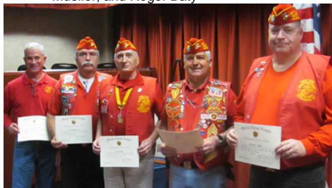
Distinguish Service Bronze Award Presented to the 2014 Detachment Officers