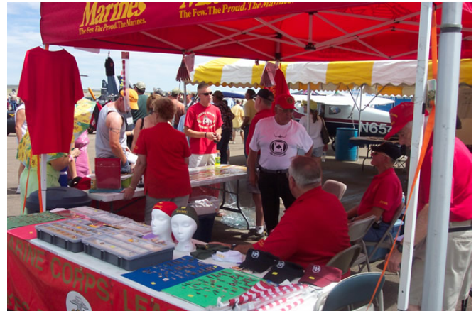
Airshow Colorado Springs 2006