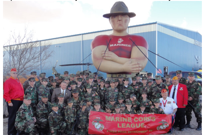
Young Marine Graduation and Award Ceremony Pueblo Colorado