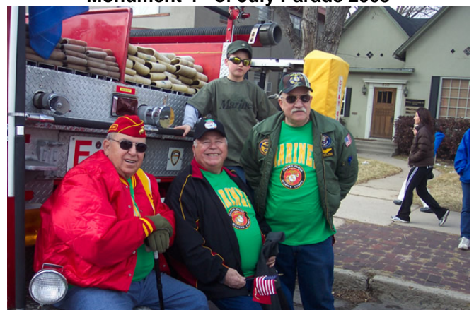
St. Patrick's Day Parade 2008