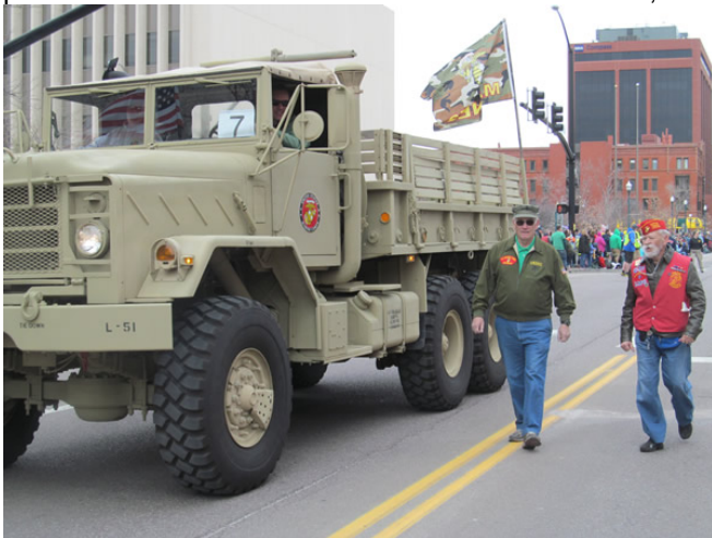
St. Patrick's Day Parade