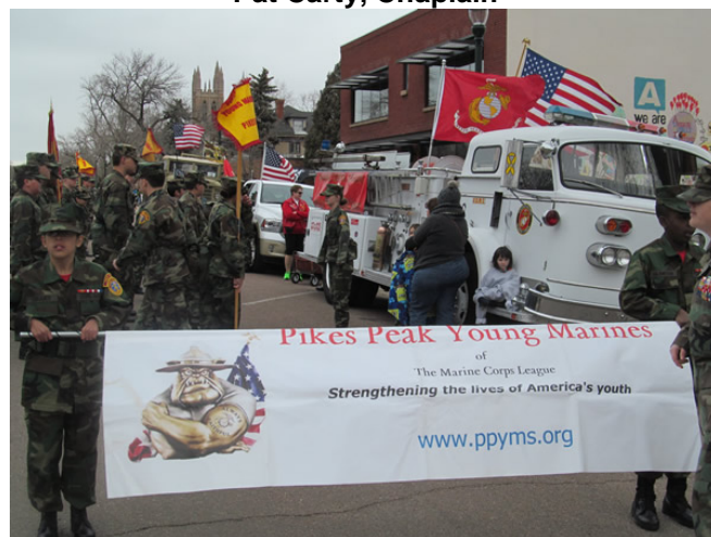
St. Patrick's Day Parade