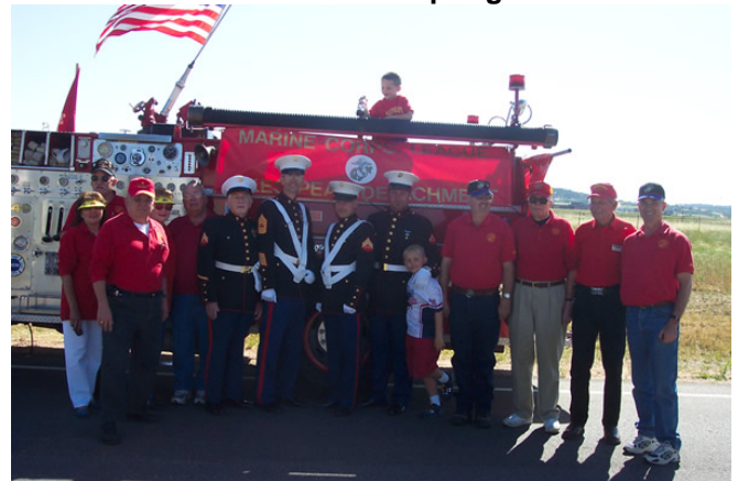
Monument 4 th of July Parade 2005

28 April 1993: The last A-6E Intruder departed from Marine Corps service. Marine All Weather Attack Squadron 332 transferred the last Marine A-6E to St. Augustine, Florida, and prepared for the squadron's transition to the F/A-18D and eventual movement from Cherry Point to Beaufort, South Carolina.