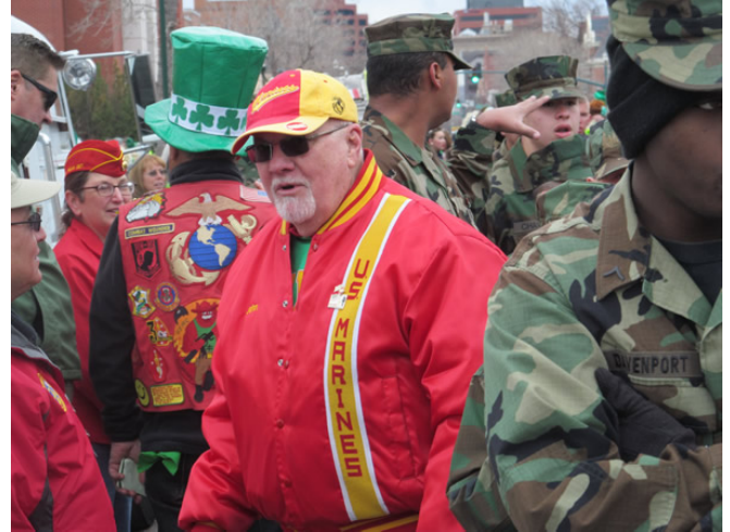
St. Patrick's Day Parade (Where am I?)

for a job well done. We salute them and thank them all for serving. The St. Patrick's Day Parade was held several hours after our monthly meeting adjourned; I would like to thank everyone for braving the cool temperatures and windy conditions to participate in this