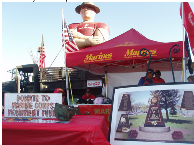
Cash Sales – Raising Funds in 2010