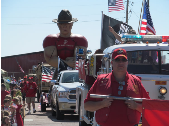
Monument 4 th of July Parade