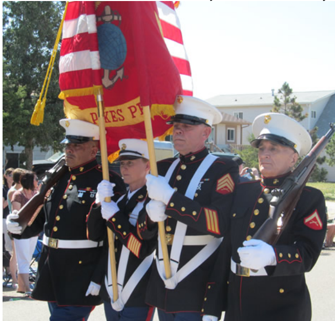
Monument 4 th of July Parade