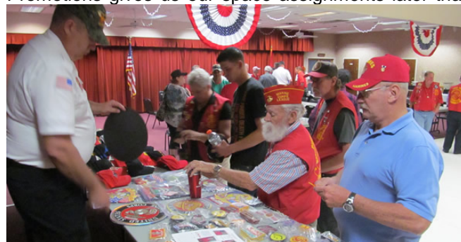
July Meeting – Get your Gear Here!