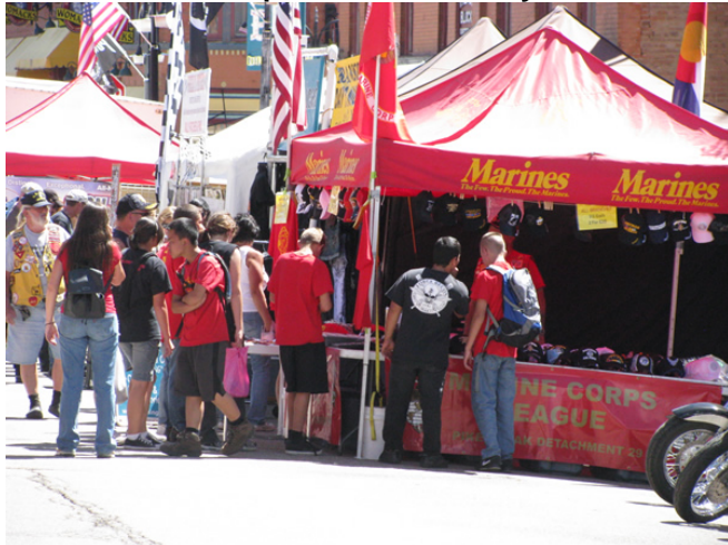
Cripple Creek 2011

well in sales at this yearly event – again, let's hope for good weather. Till I see you at the Labor Day Parade or in Metcalf Park on 1 September...Think Positive...Laugh...Have fun...Help someone less fortunate than yourself...and Continue to March.