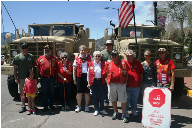
Cañon City Blossom Parade Prior to Teaming up with the Royal Gorge Detachment