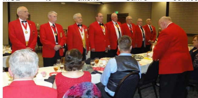
Department of Colorado Officer Installation