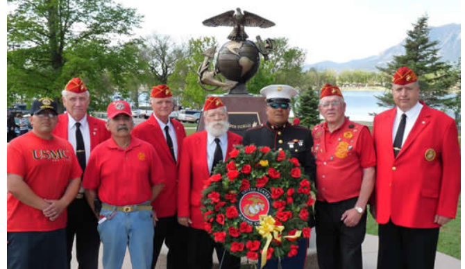
Memorial Day at Marine Corps Memorial