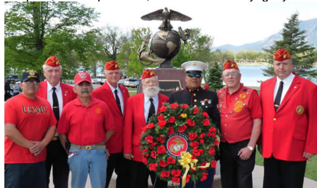
Memorial Day at Marine Corps Memorial