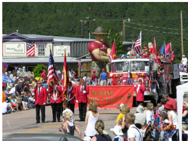
Monument 4 th of July 2009