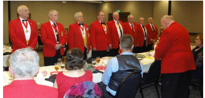
Department of Colorado Officer Installation