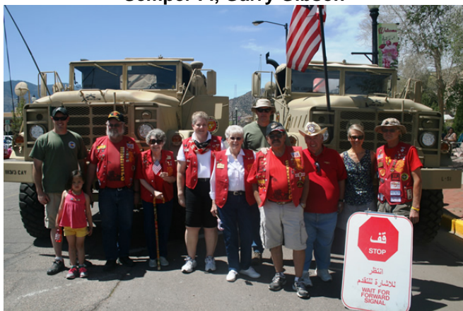
Cañon City Blossom Parade Prior to Teaming up with the Royal Gorge Detachment