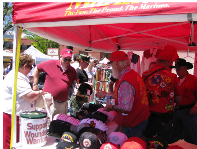
Territory Days 2010