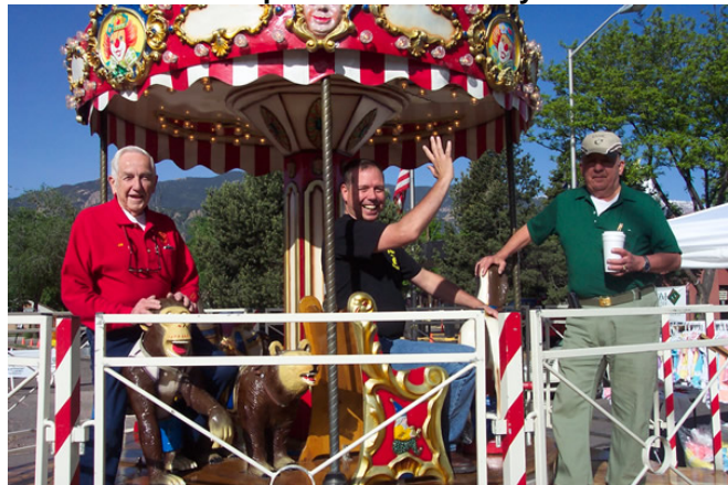
Territory Days 2007