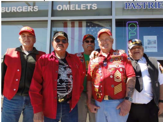
WWII and Korean War Luncheon