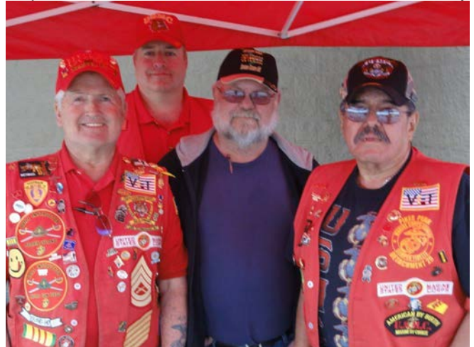
Fundraiser at Walmart