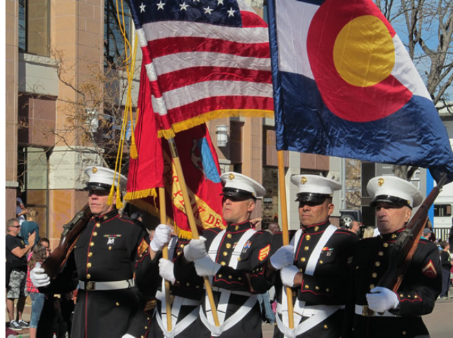
Veterans Day Parade 2013