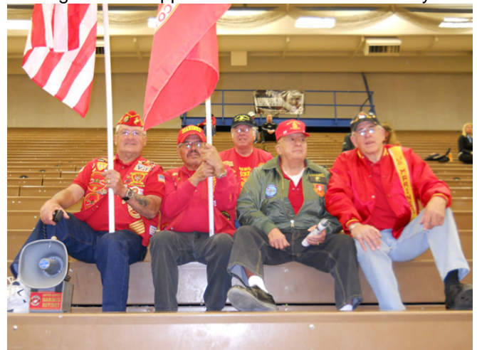
Wounded Warrior Games Cheering Section 2011