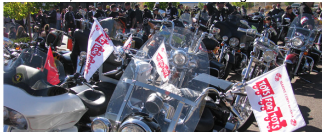
2010 High Country Toy Run Line Up of Motorcycles

($8 all you can eat) is from 0730-1000 at The Brickhouse, 424 S. Nevada. The run begins at 1100 in