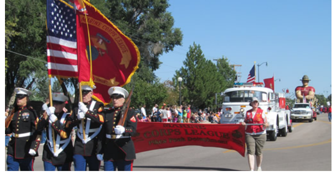
Fountain Fall Festival Parade