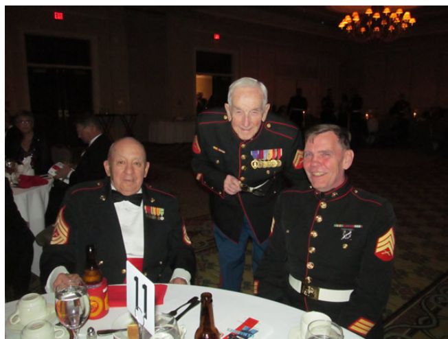
Marine Corps Ball 2012