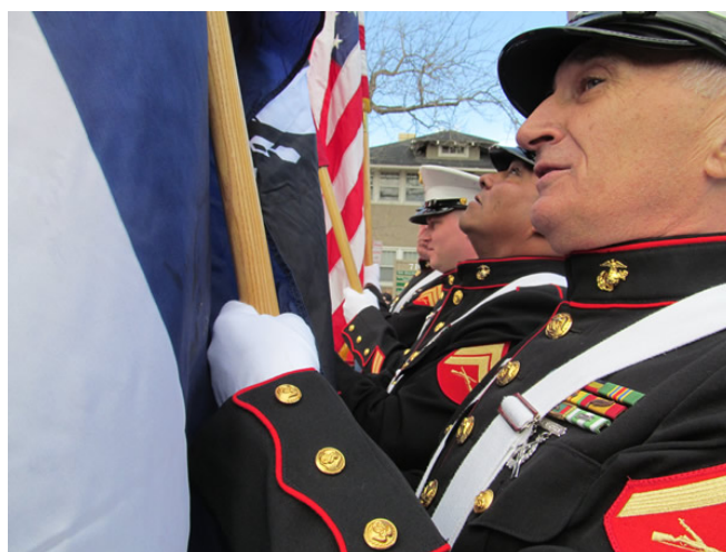
Veterans Day Parade 2012