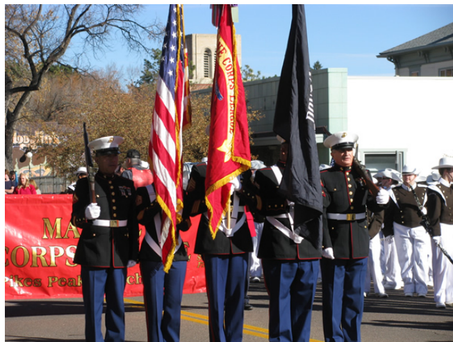
Veterans Day Parade 2010

27 November 1950: In a carefully planned assault, eight Chinese Communist divisions in Korea launched a massive attack which had as its expressed purpose, the destruction of the 1st Marine Division. This action led to the successful southward Marine Corps attack out of the Changjin (Chosin) Reservoir to the coastal port of Hungnam.