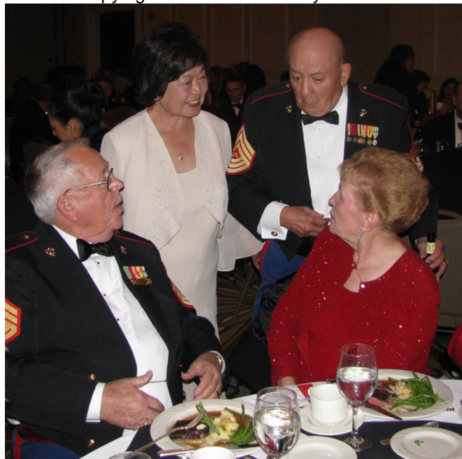
Marine Corps Ball 2011

17 November 1918: The 4th Marine Brigade, as part of the 2d Division, American Expeditionary Force, began its march to the Rhine River, passing through Belgium and Luxembourg, as part of the American forces occupying a defeated Germany.