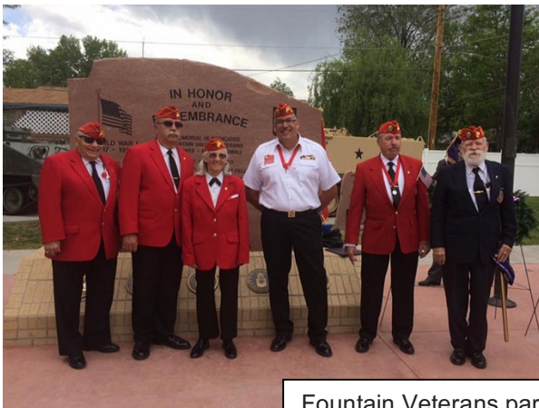
Fountain Veterans park wreath laying ceremony