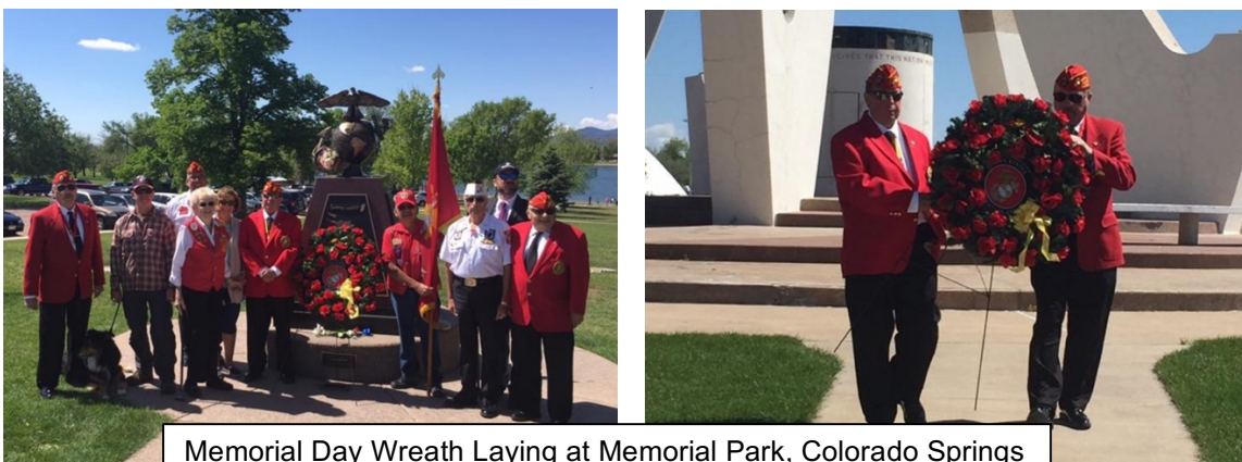
Memorial Day Wreath Laying at Memorial Park, Colorado Springs