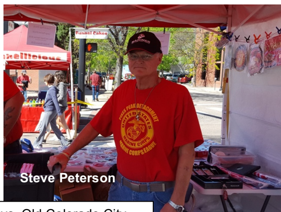
Cash Sales at Territory Days, Old Colorado City.