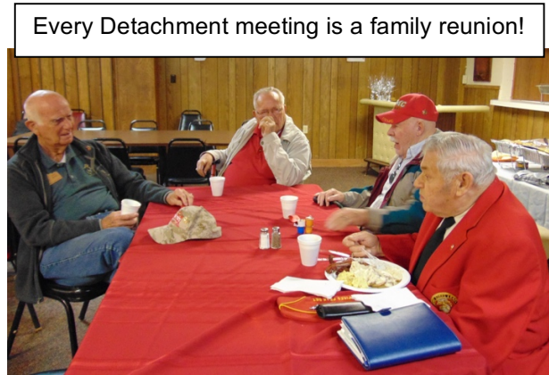
Every Detachment meeting is a family reunion!