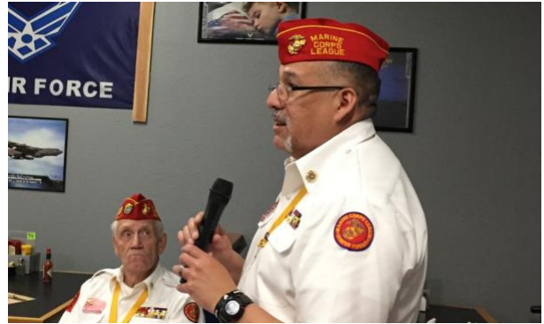
April 2018 Pikes Peak Det. meeting at Sarges' Grill. A good meeting, tasty chow and great company!