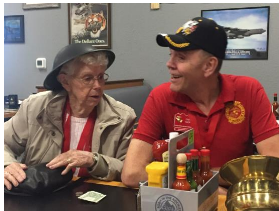
Pictures from a short and sweet Growl of the Karnivorous Kanines Pound 150.