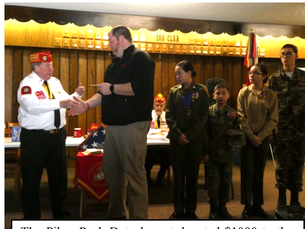
The Pikes Peak Detachment donated $1000 to the Pikes Peak Young Marines. The money will help the Young Marines continue their good works.