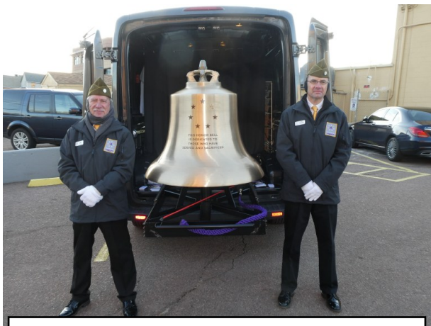
The Detachment learned about the Honor Bell and a donation of $500 was made to the foundation to fund an Honor bell for the Colorado Springs area.

Join us for the first parade of 2020. The parade is not on the same day as the Detachment meeting. We need the color guard, wheel walkers, rope handlers, banner carriers. Wear green and show the people of Colorado Springs who the motivators are! Details will be forthcoming as they become available.