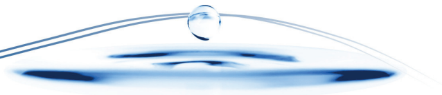
Figure EEEE: Pressure Modification System