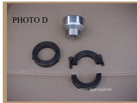
Photo D shows some simple tools I made to resize the shape of the muffler flange. I found a large 3/4 drive socket at the used tool store which had a shoulder and taper near the same size as the tube. I had a friend cut the socket to match the correct flange angle. This could then be used as a die for reforming the angle on an existing tube. I then took a pair of two-piece shaft collars the same as the OD of the tube and clamped them below the flange to

support the tube in a press. By supporting the tube at the shaft collars and applying a force to the socket in the tube, the flange size and shape can be slightly reformed and improved. Other restorers have also had good luck finding local muffler shops which could reform the flanges using their professional equipment.