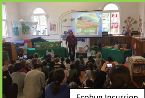
Eco Bug Incursion