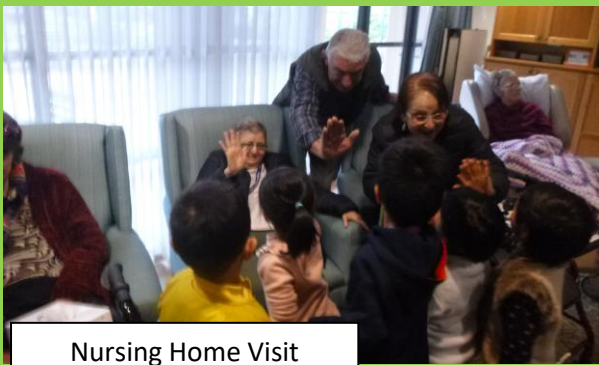
Nursing Home Visit