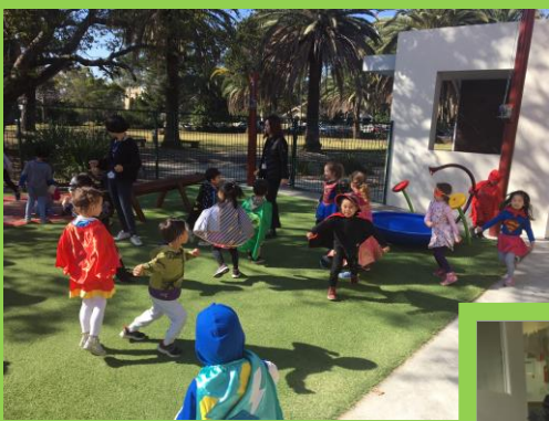
Bear Cottage Superhero Fundraiser