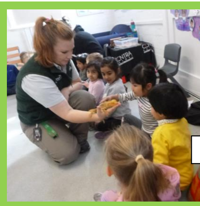
Zoo mobile visit

Here we are half way through our year already!