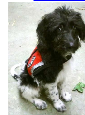
Caruth Center GRETEL