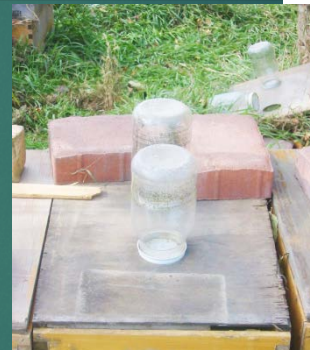
Inverted Feeder (jar)