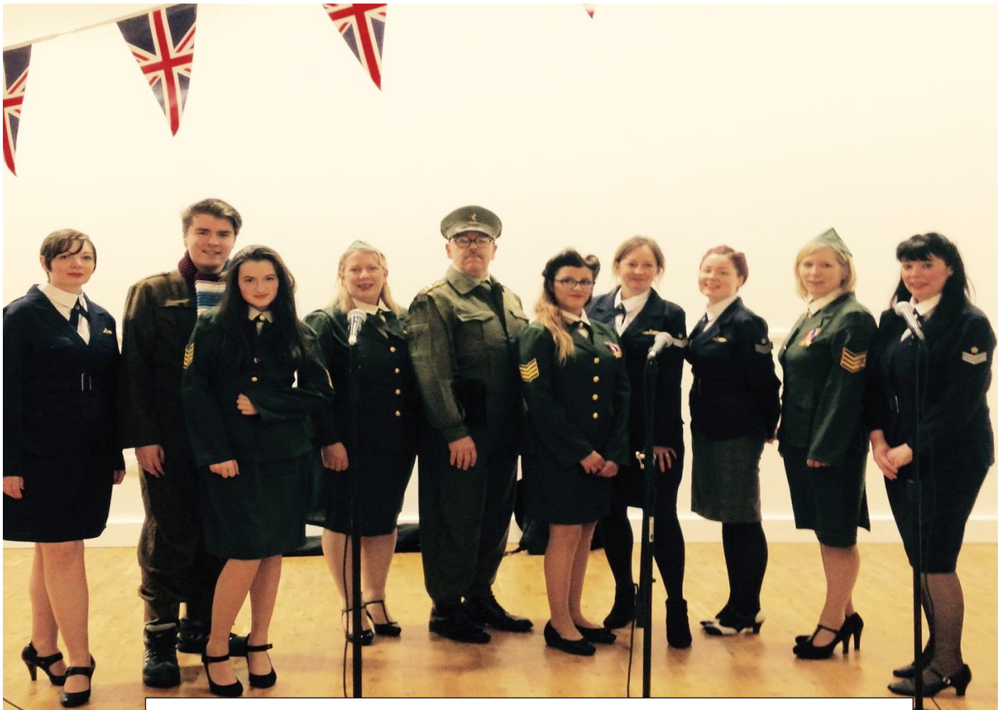
The whole of the Act Two cast ready to perform