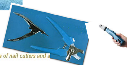
Different types of nail cutters and a grinder

EYES should be clear with no discharge or redness, as this could be a sign of infection.