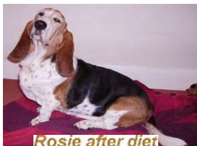
Rosie after diet