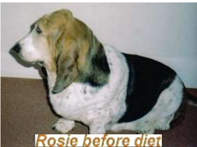
Rosie before diet